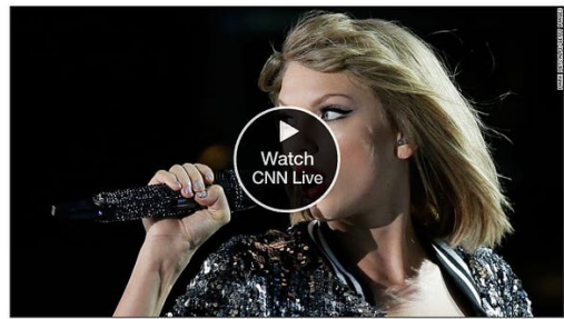
WATCH LIVE: Ticketmaster examined by Senate after Taylor Swift tickets debacle

I can't get a single US Senator (other than Ron Johnson) who is interested in exploring why so many people in the US are dying suddenly. It's really strange.