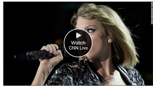
WATCH LIVE: Ticketmaster examined by Senate after Taylor Swift tickets debacle

I can't get a single US Senator (other than Ron Johnson) who is interested in exploring why so many people in the US are dying suddenly. It's really strange.