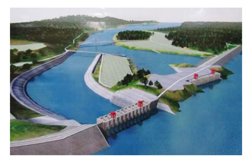
Image: <u>The Myitsone Dam</u>, on its way to being the 15th largest in the world until construction was halted in September by a campaign led by <u>Wall Street-puppet Aung San Suu Kyi</u>, a stable of US-funded NGOs, <u>and a terrorist campaign</u> executed by armed groups operating in Kachin State, Myanmar.

In "Myanmar (Burma) "Pro-Democracy" Movement a Creation of Wall Street & London," it was documented that Suu Kyi and organizations supporting her, including local propaganda fronts like the New Era Journal, the Irrawaddy, and the Democratic Voice of Burma (DVB) radio, have received millions of dollars a year from the Neo-Conservative chaired National Endowment for Democracy, convicted criminal and Wall Street speculator George Soros' Open Society Institute, and the US State Department itself, citing Britain's own "Burma Campaign UK (.pdf)."