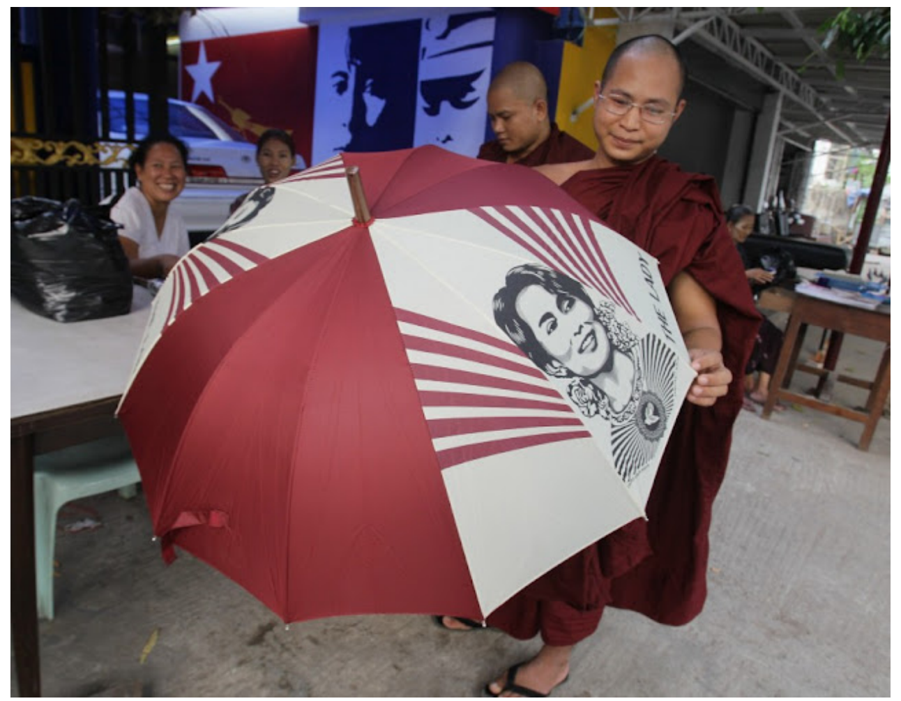
Image : An alleged monk, carries an umbrella with Aung San Suu Kyi's image on it. These so-called monks have played a central role in building Suu Kyi's political machine, as well as maintaining over a decade of genocidal, sectarian violence aimed at Myanmar's ethnic minorities. Another example of US "democracy promotion" and tax dollars at work.