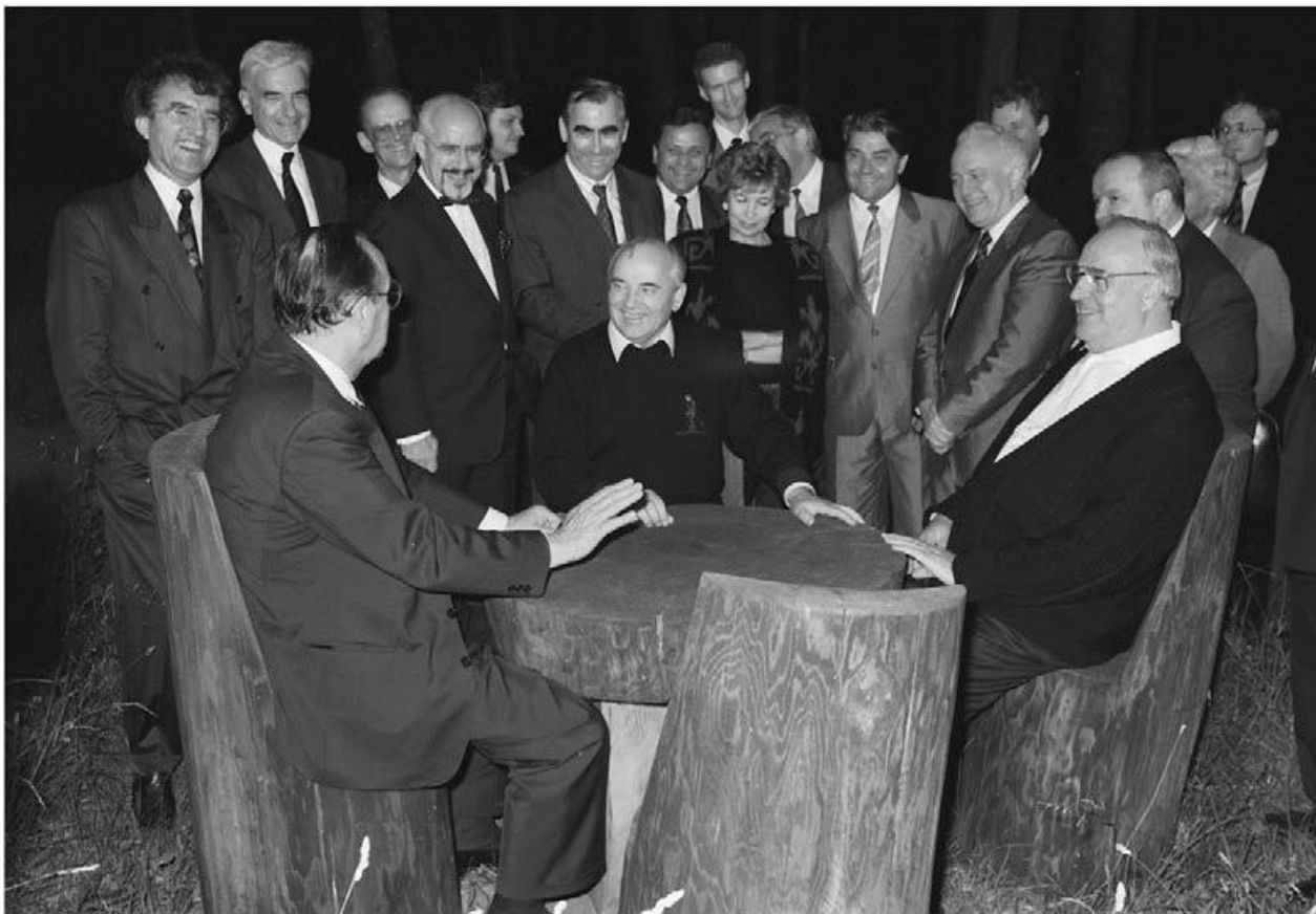
Gorbachev (seated, middle) talking with West German Foreign Minister Hans-Dietrich Genscher (left) and Helmut Kohl (right) in Russia, July 15, 1990.

The Russian side, represented by Mikhail Gorbachev , had to play it straight. The country had large numbers of other urgent issues on its plate, so his argument was simple: Moscow would not move westward – as long as the west would not move eastward. Let the countries in between be.