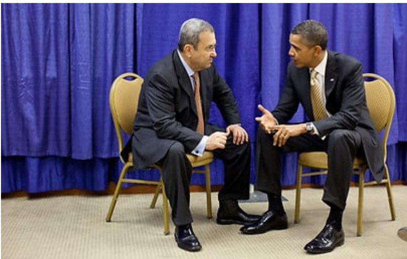
Barack meets Barak, Barack Obama and Israel’s Defense Minister Ehud Barak December 16, 2011 at the URJ Biennial Plenary, Gaylord Hotel, National Harbor

In recent developments, barely acknowledged by the US media, President Barack Obama met privately (December 16), behind closed doors with Israel’s Defense Minister Ehud Barak. The meeting was held in the outskirts of Washington DC at the Gaylord Hotel, National Harbor, Maryland under the auspices of the Union for Reform Judaism .