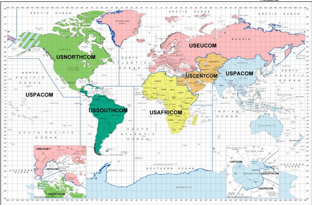
THE WORLD 1:60,000,000 THE WORLD WITH COMMANDERS' AREAS OF RESPONSIBILITY EDITION 8 NGA BASED ON UNIFIED COMMAND PLAN 17 DECEMBER 2008 SERIES 1107

State of Alaska assigned to USNORTHCOM's Area of Responsibility. Forces based in Alaska remain assigned to USPACOM. 1:60,000,000 MILLER CYLINDRICAL PROJECTION The 1950 Israeli proclamation that Jerusalem be the national capital is not recognized by the United States. * West Bank and Gaza Strip - "Israeli-occupied with current status subject to the Israeli-Palestinian Interim Agreement - permanent status to be determined through further negotiation." SERIES 1107 EDITION 8 NGA PREPARED AND PUBLISHED BY THE NATIONAL GEOGRAPHIC INTELLIGENCE AGENCY ST. LOUIS, MO Map Information as of 2008 MAP EFFECTIVE 17 DECEMBER 2008 USERS SHOULD REFER CORRECTIONS, ADDITIONS, AND COMMENTS TO THE NGA ENTERPRISE SERVICE DESK: 1-800-450-0699. COMMERCIAL: 301-227-8811. DSN: 287-8811. UNCLASSIFIED EMAIL: ENTERPRISESERVICE@NSA.GOV. SUPPORT: ESC@NSA.GOV. MAIL: ESC@NSA.MIL. OR WRITE TO: DIRECTOR, NATIONAL GEOGRAPHIC INTELLIGENCE AGENCY ATTN: ESC. MAIL STOP D-240. 4800 SANGAMORE ROAD, BETHESDA, MD 20816-0003. THE REPRESENTATION OF BOUNDARIES IS NOT NECESSARILY AUTHORITY.