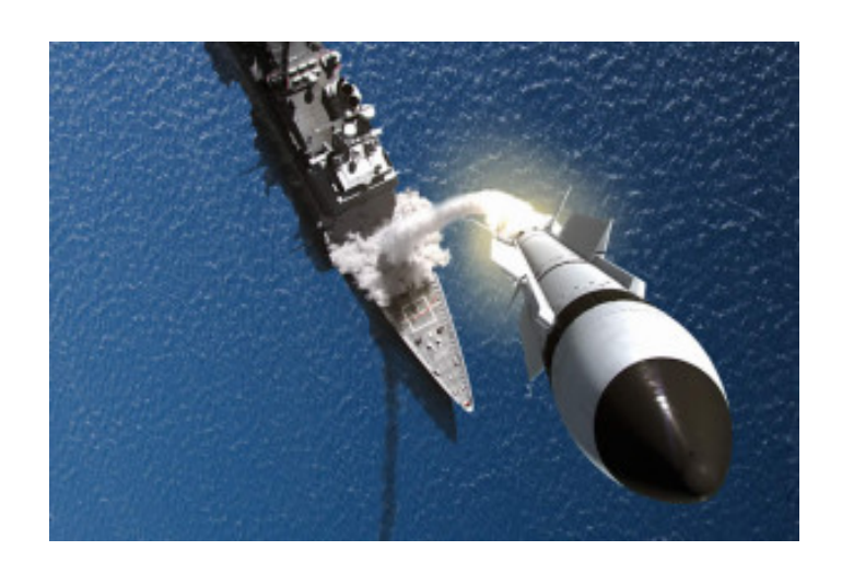
Raytheon sea-launched missiles.

Thus no one anywhere on our Mother Earth should ever listen to the moralistic preaching that comes from Washington about democracy, freedom, peace, or the rule of law. It's all Hollywood talk – a scripted propaganda machine that has sold an image to the world. Fortunately the initial shine has worn off the Stars & Stripes and most people around the globe clearly understand what is really going on.