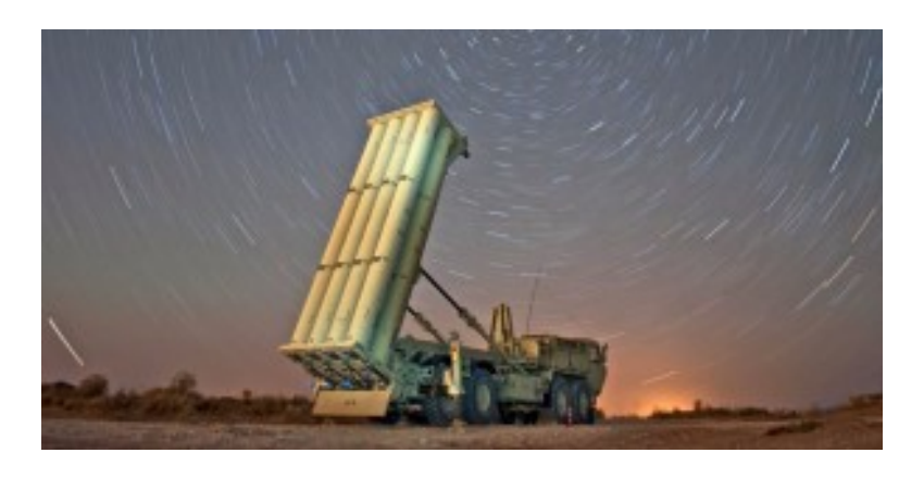
US THAAD missiles.

The MD radar base at Kyogamisaki would assist the Pentagon's attempt to intercept Chinese retaliatory nuclear missiles that they would fire after the US launched a first-strike attack. We are constantly told that MD is being deployed by the Pentagon in Japan, Okinawa, South Korea, Taiwan, Guam, the Philippines, and Australia to protect against North Korean missiles. This is a lie and a tactic to redirect the discussion. In fact the US is deploying MD to be able to control and dominate China and Russia.