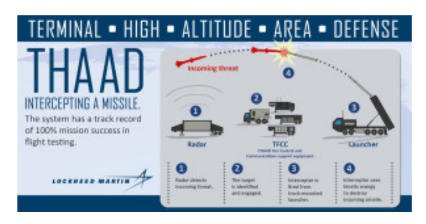
Lockheed Martin's THAAD designs.

The Pentagon is deploying four basic MD systems today. Inside the US (California and Alaska) are Ground-Based Midcourse MD interceptors buried deep underground. Their job is to hit a bullet with a bullet in deep space after a retaliatory strike by Russia or China. This program has the most difficult technical task and has the worst testing results.