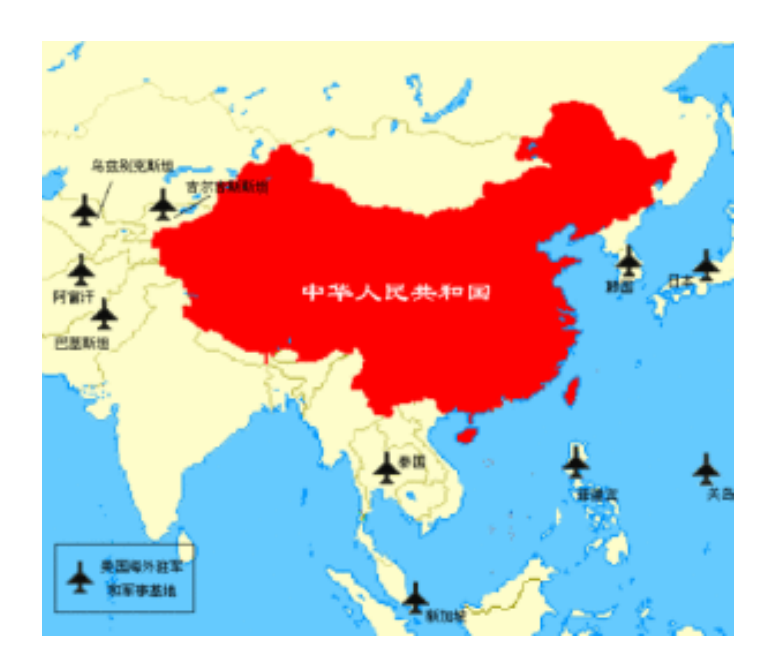
US military bases around China.

China imports 80% of its resources on ships and thus we see the Pentagon 'pivot' as a military strategy to possibly block China's sea routes – literally putting a loaded gun to Beijing's head. China has responded by building a couple new bases on tiny coral reefs to ensure their unhampered access to the sea lanes in their region.