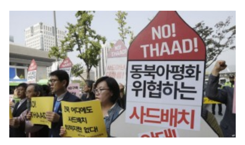
South Koreans protesting the THAADs.

MD is not just a theoretical program. The US Space Command holds a computer war game each year where they practice such a first-strike attack – they call it the 'Blue' team against the 'Red' team. In the war game a US first-strike is launched against Russia and China. When they respond by firing their own nuclear missiles that have survived the initial Pentagon attack, the Space Command's MD systems go to work to pick of the remaining missiles.