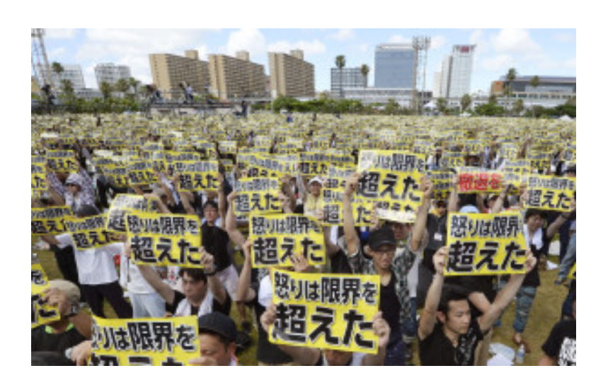
Thousands of Japanese protest US bases.

Add up the current US 'pivot' into the Asia-Pacific; the Japanese Shinzo Abe government's 'reinterpretation' of peaceful Article 9 in their constitution to allow Tokyo to deploy offensive military forces; the destabilizing US-Japan-South Korean military alliance; and we find the makings of a very aggressive program that could easily trigger World War III.