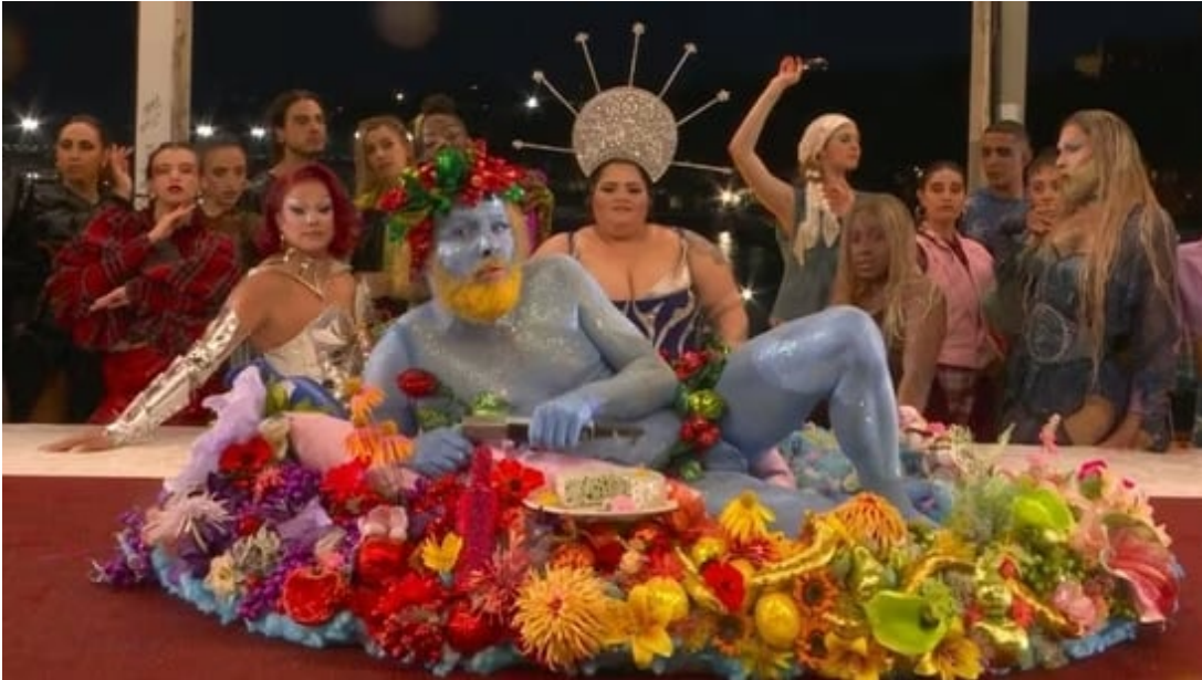
French singer Philippe Katerine during the Paris Olympics opening ceremony

The ceremony was littered with pre-recorded scenes with references to non-traditional sexual inclinations that left many viewers aghast. It appeared to be an overt display of LGBTQ+ perversity and sexual abandonment, containing a bearded drag queen crawling on all fours; the beginnings of a menage à trois; and an intimate embrace between two men who danced, hugged, kissed and held hands. The in-your-face nature of the show seemed to be an insult to people with conservative or God-conscious values. I for one would not allow impressionable children to watch this degrading melee.