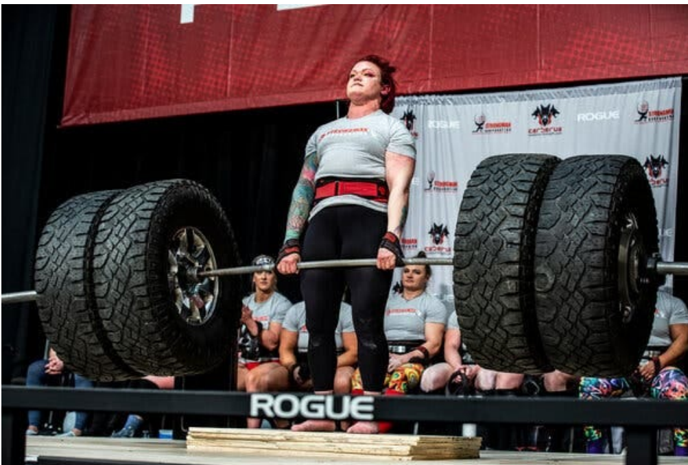
Competitive powerlifter and professional wrestler Sara Lee (Sara Weston), age 30, died suddenly July 10, 2022, no cause of death given ( click here )