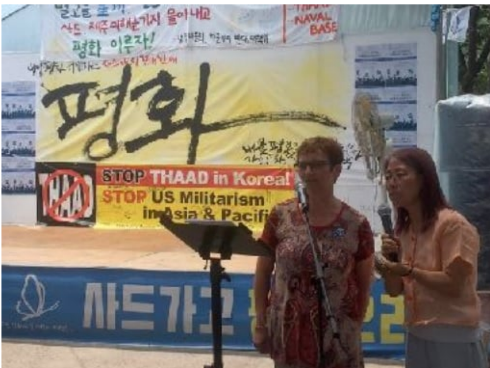
Inge Höger visits So-seong-ri to express her solidarity with the struggle against THAAD, July, 9. □ Free Prisoners of Conscience, Korea.