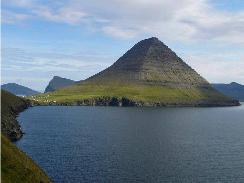
Pyramid-like mountain in Russia

It also appears that ancient pyramids that similar in design can be found worldwide, including in China, Australia, Mexico, and the USA (in Illinois). Below is a fascinating picture of mountains in Russia and Bosnia. Some people assert that these are actually 'very' ancient pyramids, that have been subject to erosion and vegetation growth, and therefore now look like mountains.