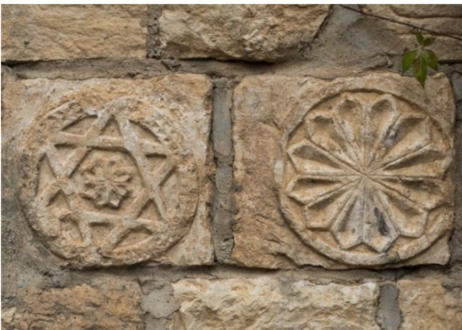
Ancient temple in Iraq

The use of the satkona is evidenced in ancient Vedic cultures dating back over 5,000 years ago. The satkona has been used throughout the ages in India, Nepal, China, Tibet, Sri Lanka, and other countries in Asia by proponents of Vedic Vaisnavism, Jainism, and also in Buddhism. In the west and the middle-east the Carthaginians, the Greeks, Romans, Christians [Catholic, Orthodox and Coptic], Muslims and Medieval Alchemists also used the satkona. Below is an image of a satkona in an ancient temple in Iraq - an area that is in modern times pre-dominantly Muslim.