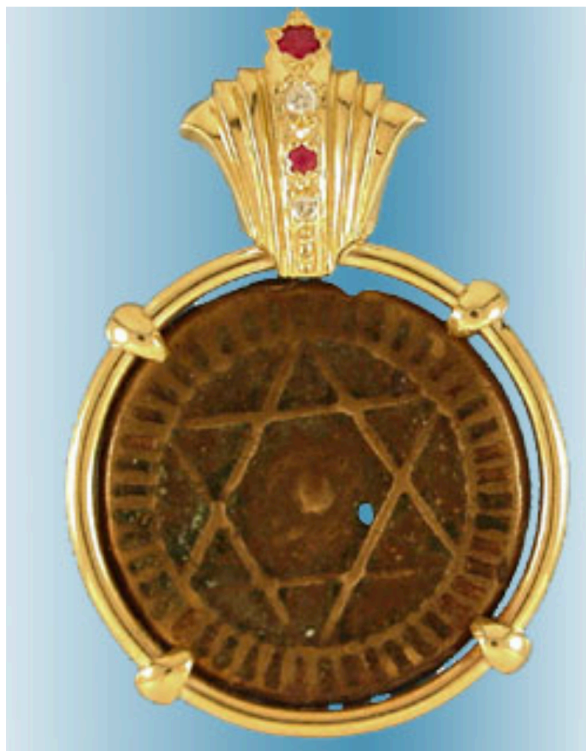
Phoenician coin (500 BC)