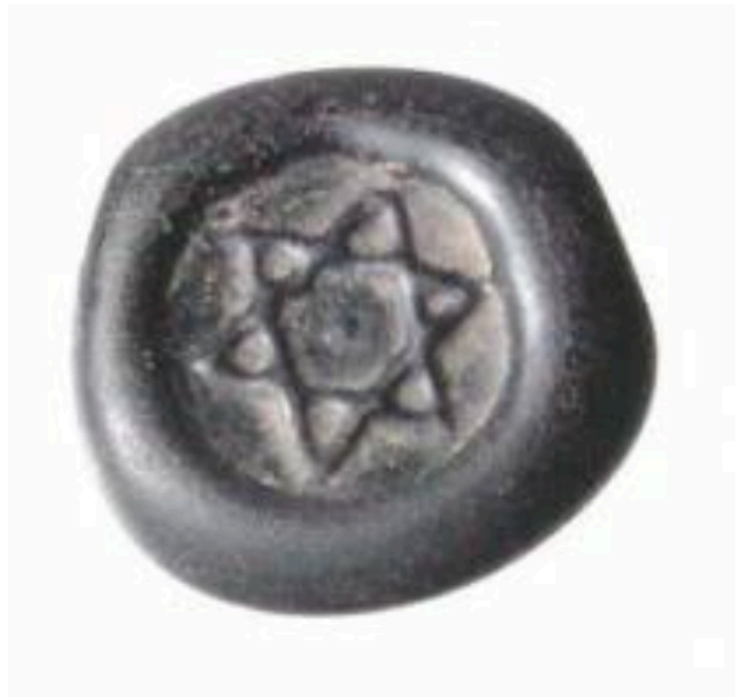
Ancient Fatmid weight (Egypt)