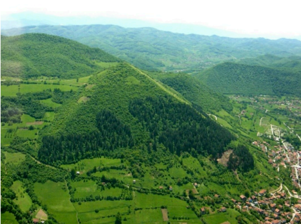
Pyramid of the sun in Bosnia

Could these structures of advanced engineering worldwide be proof standing that ancient mankind was not primitive, but highly advanced? and that civilisations capable of world-wide communication and travel existed in the very ancient past? This narrative is in contrast to the history we have been taught in school.