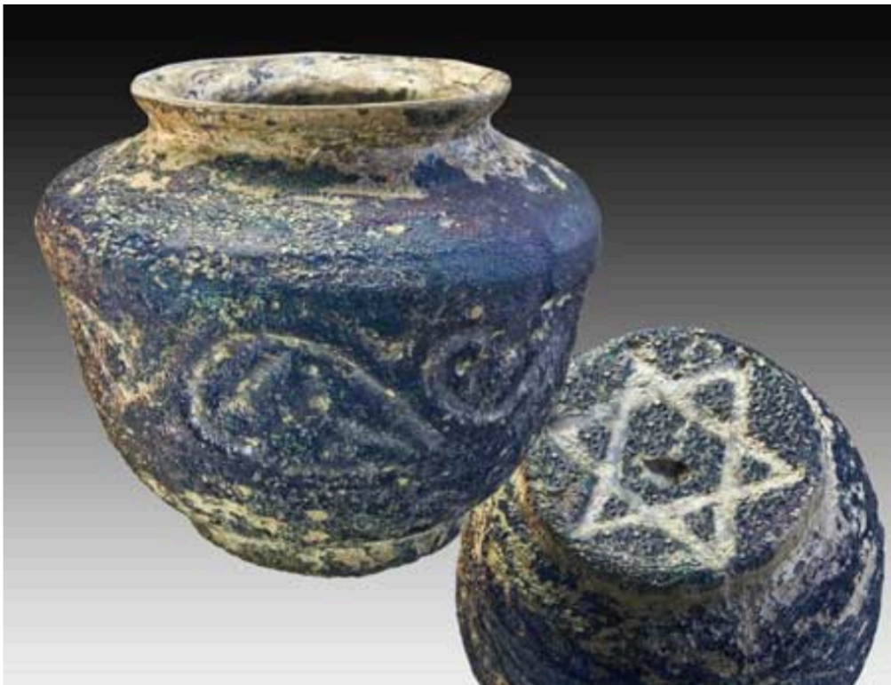
Ancient Arabian jar