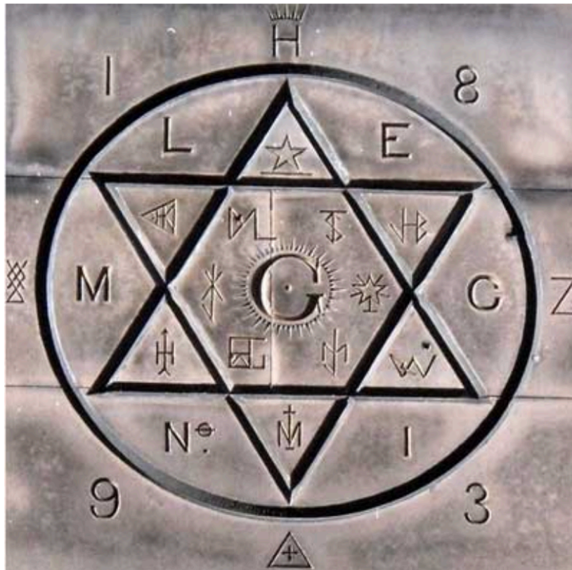
Freemason lodge Edinburgh

The satkona is evidenced in many cultures dating back long before the appearance of Jesus Christ. This includes in Sumeria, Iraq, Crete, Mongolia, Japan (in some of the oldest shrines of Shinto), Sri Lanka, Egypt, as well as in the lands currently known as Israel[1].