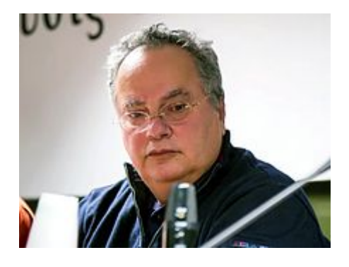
Nikos Kotzias, Syriza politician and present Foreign Minister of Greece, in 2013.

The Anastasiades team seemed quite prepared to make further concessions in exchange fora negotiated BBF solution. In the spirit of goodwill the President ignored the danger signs written on the wall and failed miserably to anticipate (or refused to accept) the obvious. Over optimistic and gullible the Cyprus team continued trusting that Turkey would change its behaviour and act honorably.