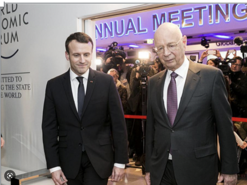
Macron unveils bold, inclusive agenda for globalization - Saudi Gazette

Emmanuel Macron is not only a protégé of The Rothschilds, he is also a WEF