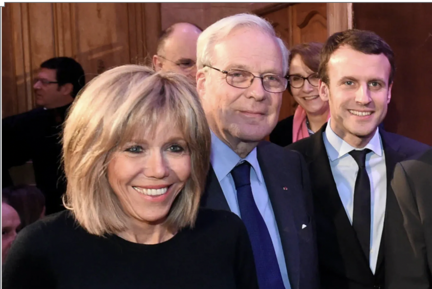
■ Brigitte Macron, le Baron David de Rothschild et Emmanuel Macron, en février 2016.

Emmanuel Macron is a former “investment banker” and obedient servant of LCF Rothschild . He does not represent the citizens of the French Republic.