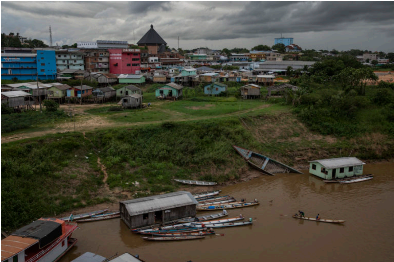
Houseboats on the Juruá River in the city of Cruzeiro do Sul, Acre state.

The existing BR-364 highway starts in the city of Limeira in São Paulo state, and runs more than 4,300 kilometers (nearly 2,700 miles) northwest to the town of Mâncio Lima in Acre. Successive Brazilian governments have weighed plans since the 1970s to extend it into Peru, giving Brazil a land route to the Pacific; the extension was even referred to in the decree establishing Serra do Divisor National Park in 1989, under the presidency of José Sarney. But when officials finally did inaugurate the Interoceanic Highway, in 2010, the link into Peru ran from Rio Branco, the Acre state capital, 670 km (415 mi) back down the BR-364 from Mâncio Lima.