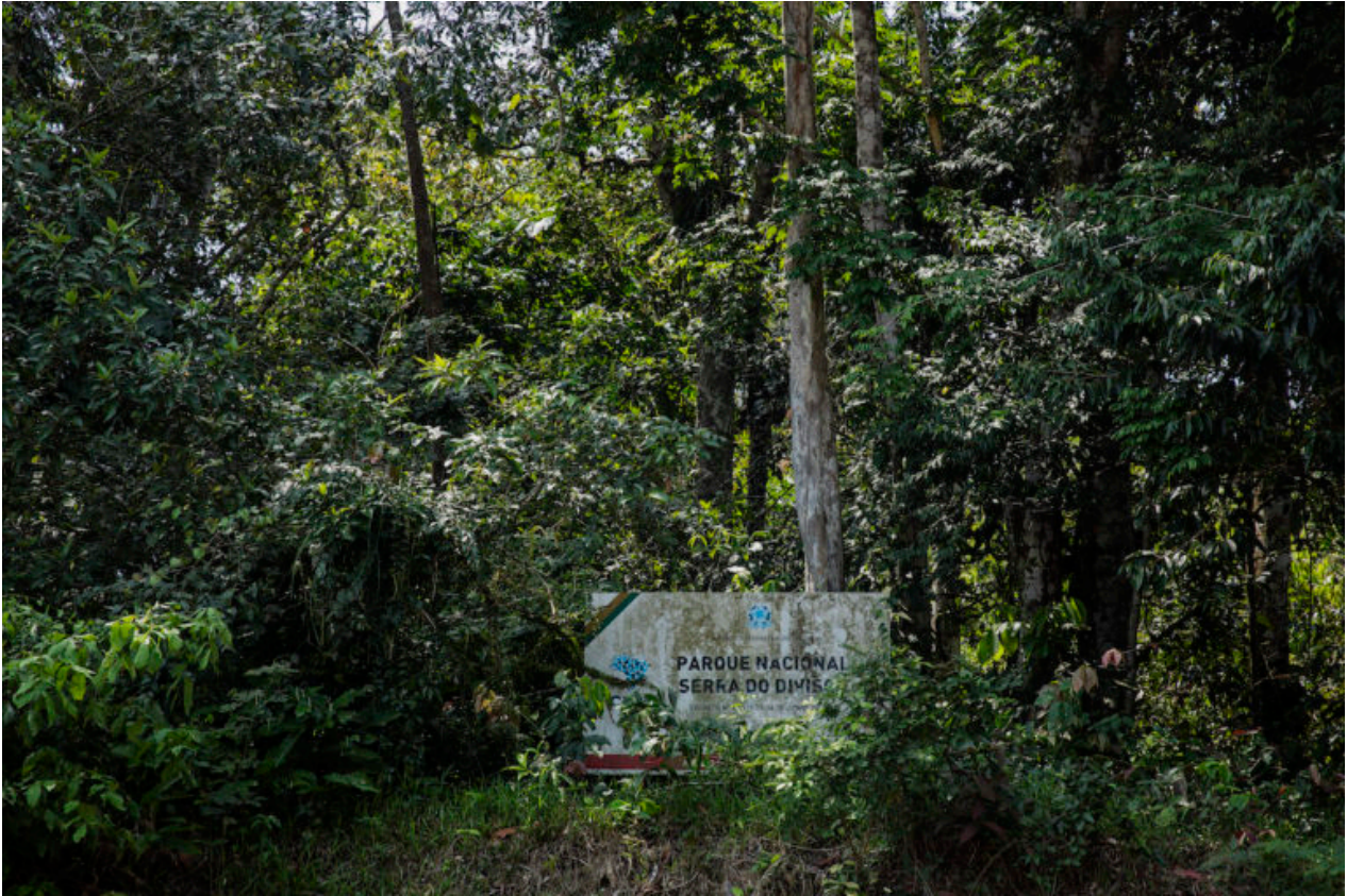
Sign indicating the limits of Serra do Divisor National Park in Acre state.

The proposal, however, ended up being withdrawn days later due to pressure from Brazil's National Defense Council, a military-led body, on the grounds that such a recognition posed a threat to national security.