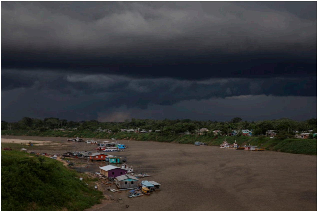
Houseboats on the Juruá River in the city of Cruzeiro do Sul, Acre state.

“The highway that goes through Assis Brasil has a serious problem. It exits in the high cordillera and is more than 16,000 feet [4,900 m] high. There is no truck that passes there, it has so many curves that it is not viable,” he said. “The most important exit is through [the] Juruá [River], because the cordillera has an altitude of 6,500 feet [2,000 m].”