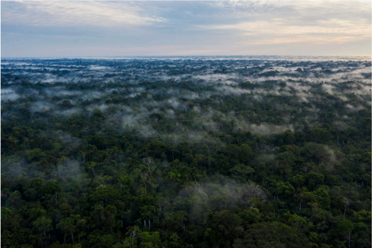
Aerial view of the forest in Serra do Divisor National Park, Acre state.

This catalog of life continues to grow. Silveira is working with other researchers on a new paper that will show that the list of plant species recorded in the park has increased by 63% since 1997, when 720 of them were identified. On average, three species are found in Serra do Divisor every two months: species that are either new to the park, new to Acre, or even new to science.