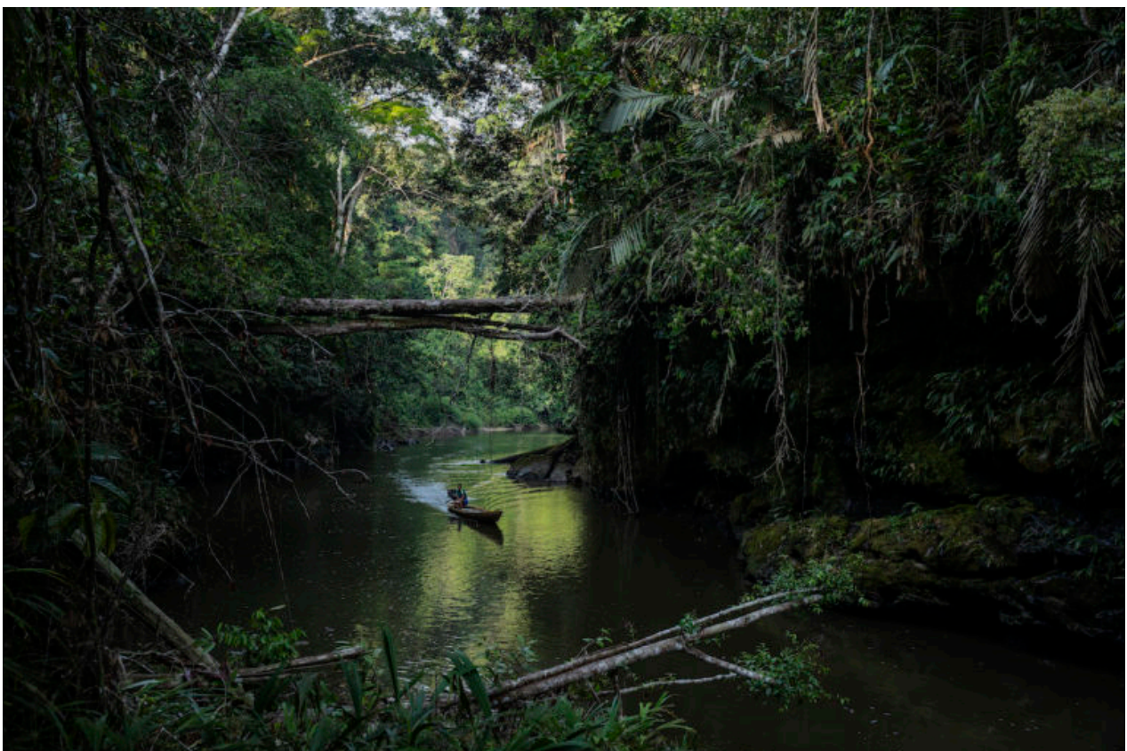
A canoe navigates the waters of the Moa River in Serra do Divisor National Park, Acre state, one of the most biodiverse areas of the Amazon. Image by Lalo de Almeida/Folhapress.

With three inns maintained by local residents, Pé da Serra is a base for tourists in search of waterfalls, panoramic views and jungle trails. One of the most beautiful and impressive sites is the Moa River canyon. It’s a 40-minute boat ride amid green mountains, a scenery more often associated with the Peruvian Amazon yet within sight of the Andes.