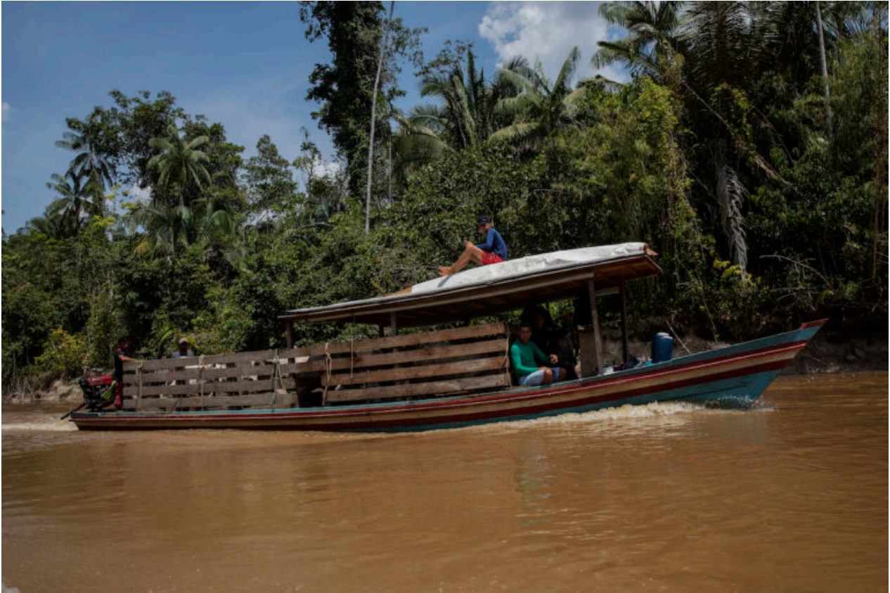
A boat transporting cattle on the Moa River, inside Serra do Divisor National Park in Acre state.