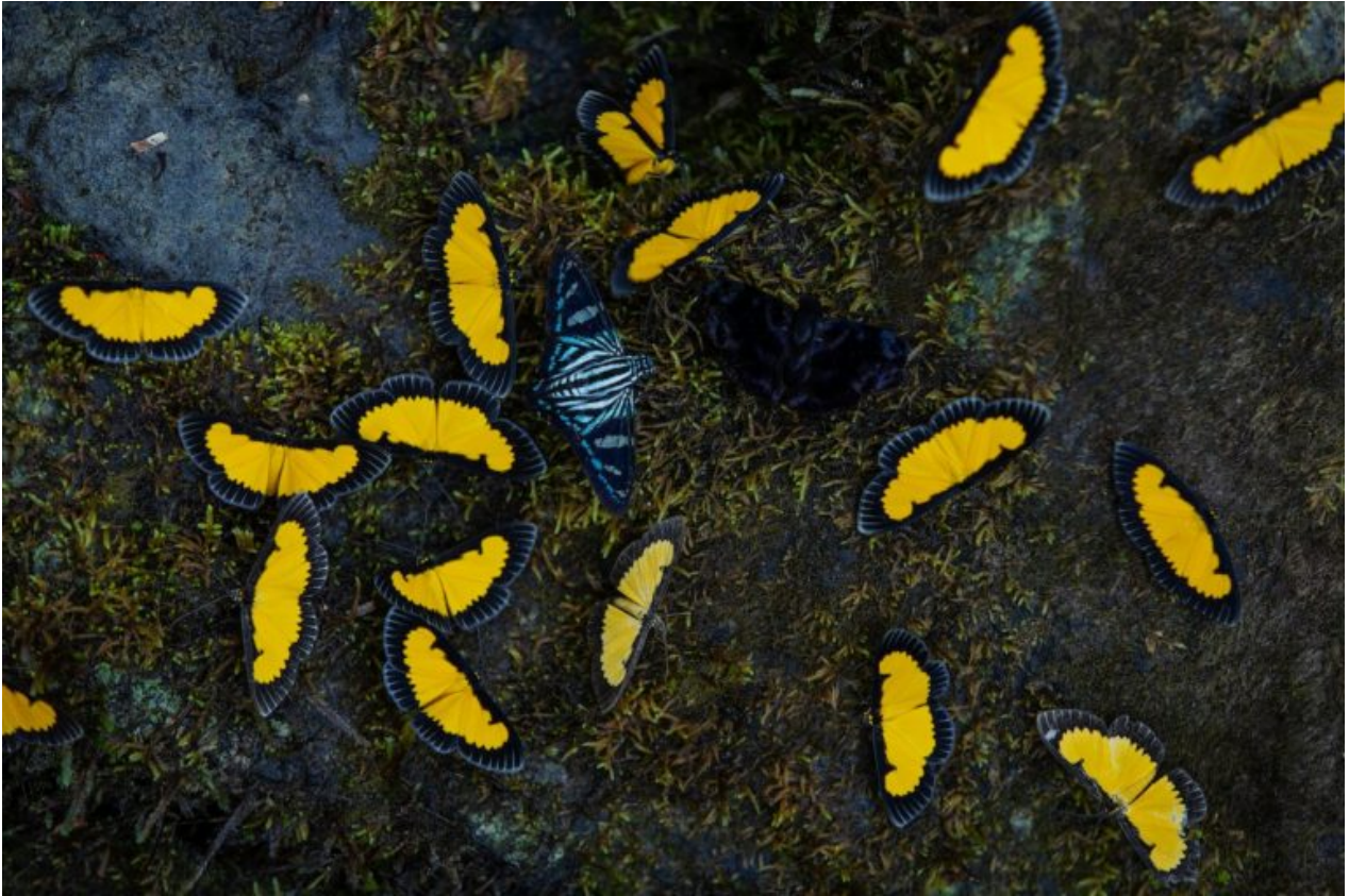
Butterflies on the banks of the Moa River in Serra do Divisor National Park.

In November 2019, the three biologists participated in a research expedition for a vertebrate census to commemorate the park's 30th anniversary. They found nearly 80 species of amphibians and 40 species of lizards and snakes.