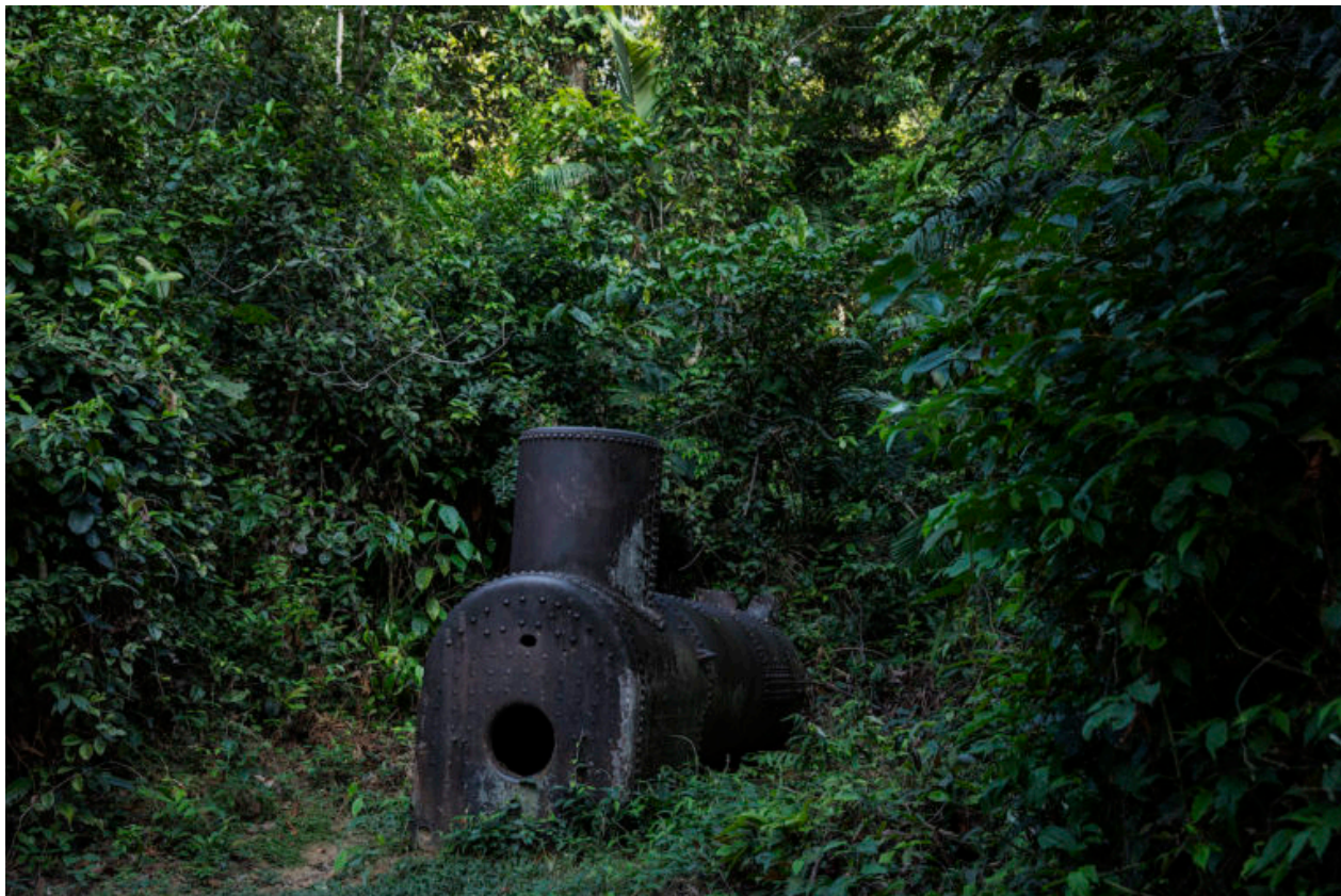
Old boiler used in a borehole by Brazilian oil and gas company Petrobras on the banks of the Moa River inside Serra do Divisor National Park, Acre state.