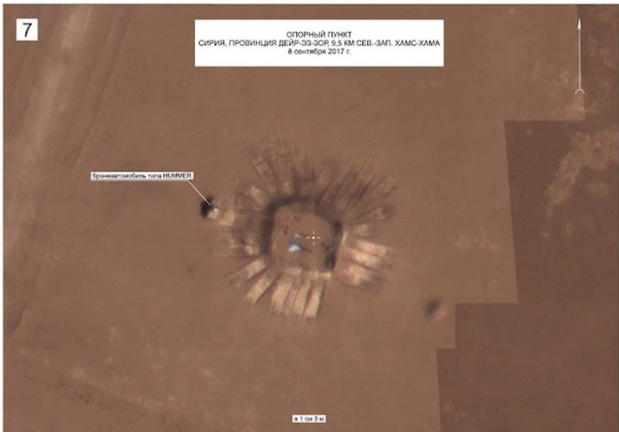
“This means that all the US personnel there feel quite secure in the districts, controlled by