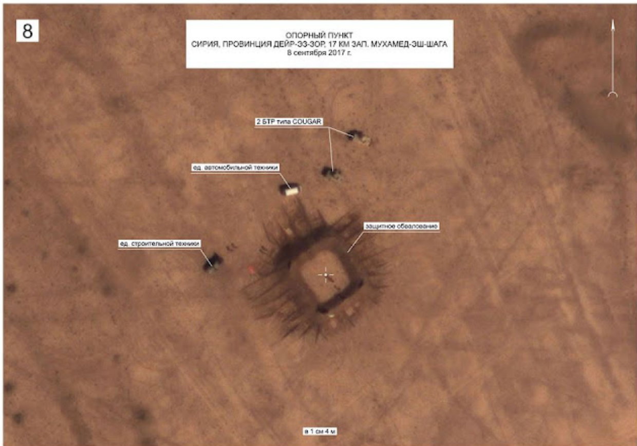
“The pictures show clearly that units of the US special force are located in the strongholds, the IS militants had equipped,” the statement reads.