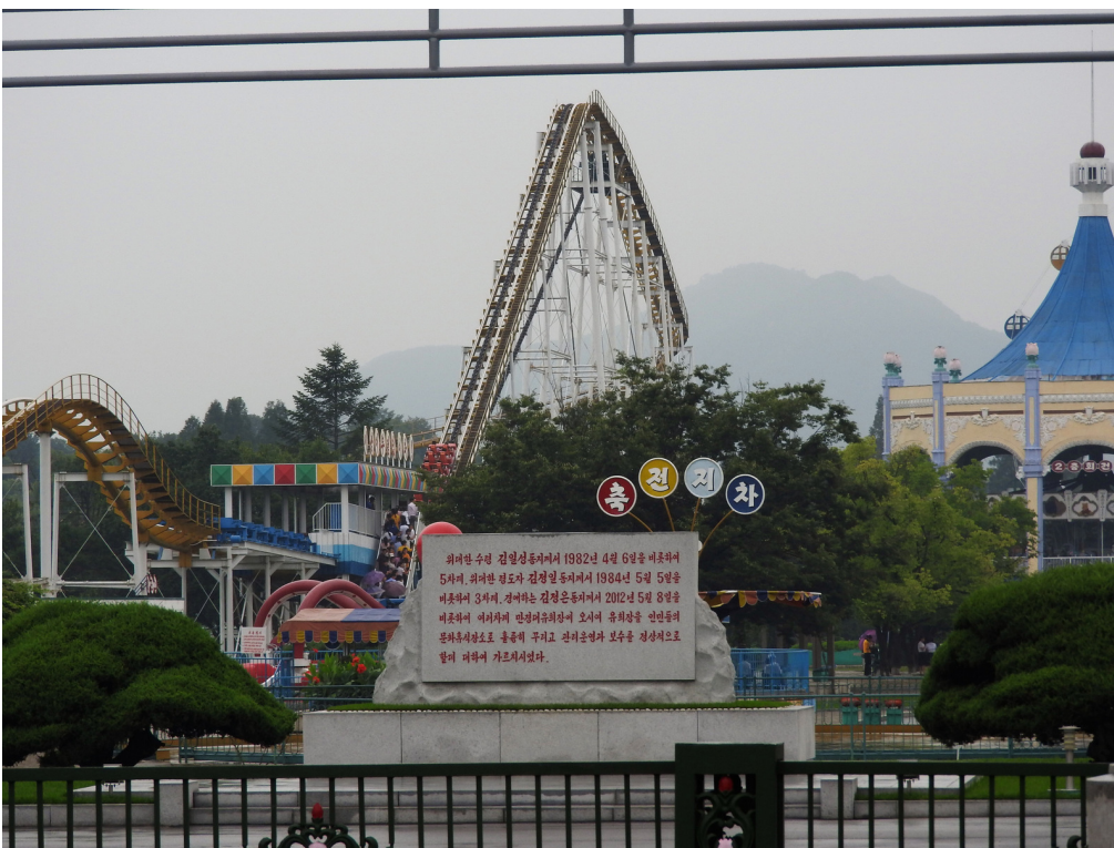
At the Kaeson Youth Amusement Park inside the city one night, I interacted with people and tried out some of the rides. The park was packed with families and children, including a group of 14-year-olds who had visited multiple times. A schoolteacher from Nampo City said she frequently brings her students to visit. A young man next to me on one of the rides filmed with his mobile. With an entrance fee of 200 North Korean Won (about US $0.22), the lines were long. Photo: A second amusement Park outside of Pyongyang.