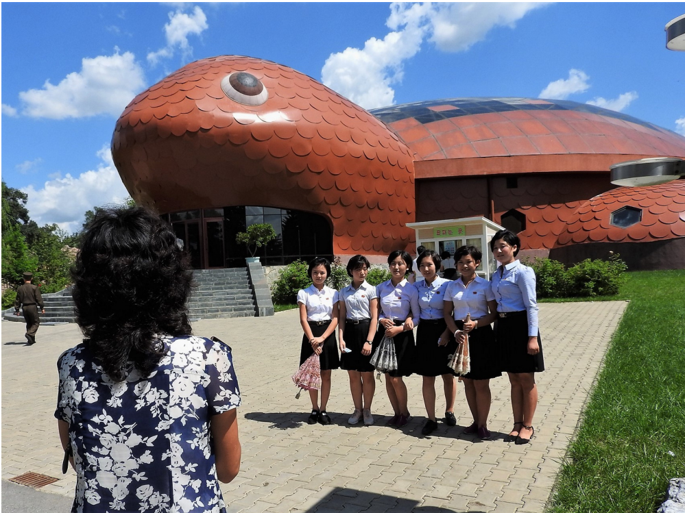
A group of schoolgirls pause for a portrait photo at Pyongyang's zoo. Watch a clip from the zoo.