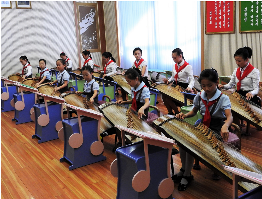
Students at the Mangyongdae Children's Palace playing the traditional Korean instrument, the kayagun. Listen to their performance here .

The Pyongyang International Football School opened in 2013. The complex includes a massive stadium and a school teaching all subjects, with football as a focus for the roughly 200 students. Different classes practiced their skills outside, doing warm-up drills to energetic music. When years ago I lived in Korea's south, practicing Tae Kwan Do I warmed-up to similar drills.