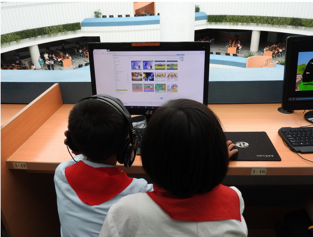
Pyongyang's Science and Technology Center, completed in 2015, is an expansive structure heated by geothermal energy, and with drip irrigation-watered live grass on inside walls. Its more than 3,000 computers are solar powered, the library has books in 12 foreign languages, and a long-distance learning program enables people from around the country to study and earn a degree equivalent to that of in-university studies. Watch a tour of the center.