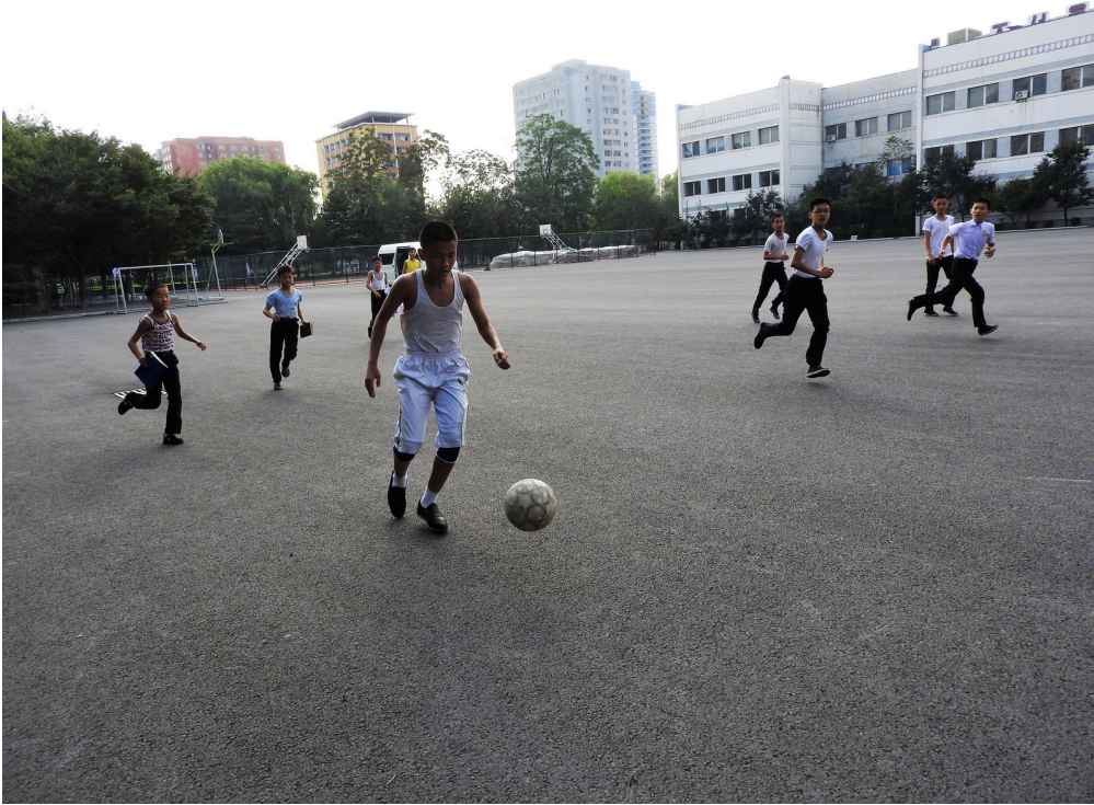
Students playing football outside the Middle School. Watch the clip here.