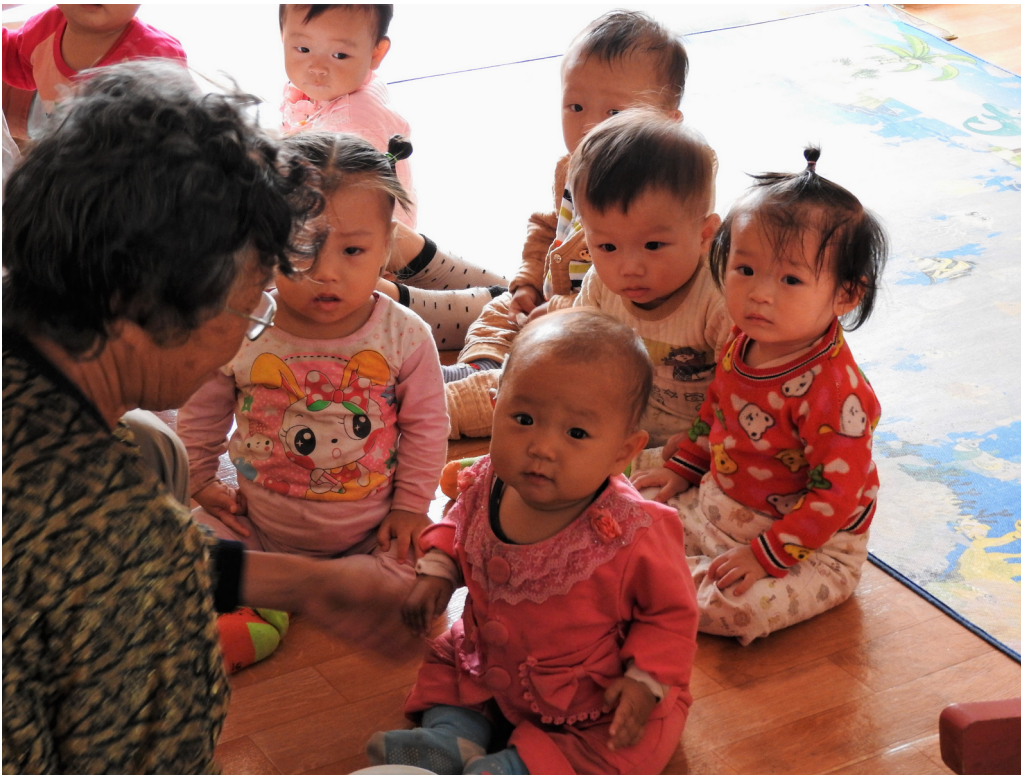
Inside the child-care center of the Jangchon Cooperative Farm. The cooperative also includes a cultural center for meetings and events, and rows of greenhouses.