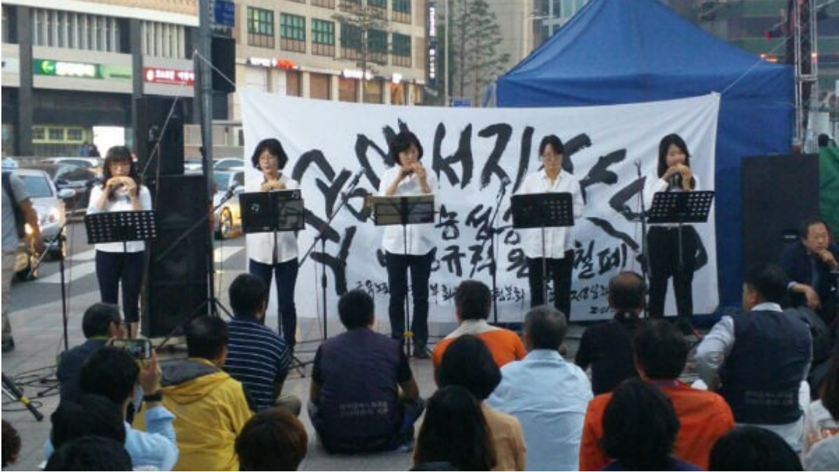
Supporters performing for the two roof-top protesters.