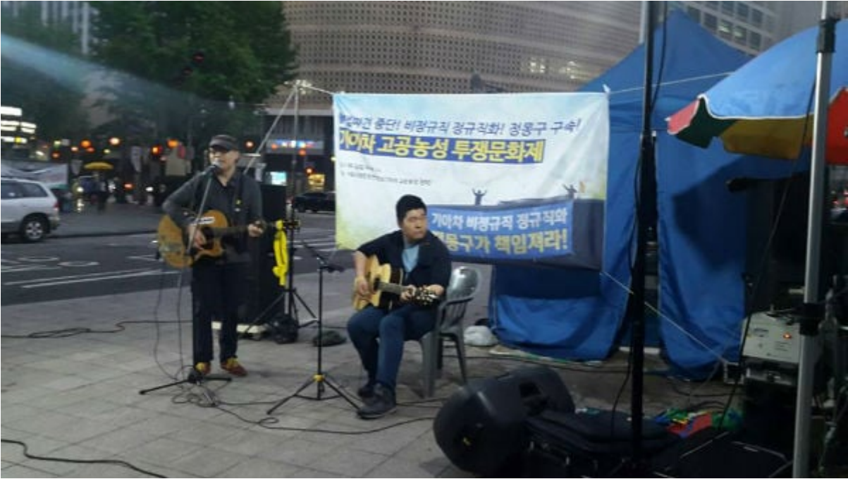
Musician supporters on the ground playing music in solidarity with the roof-top sit-in.