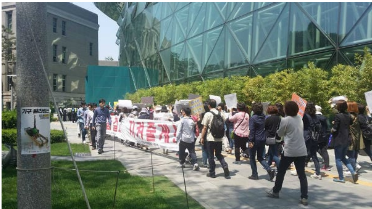
Supporters of the KIA Motors temporary employees demanding equal treatment and fair work conditions.