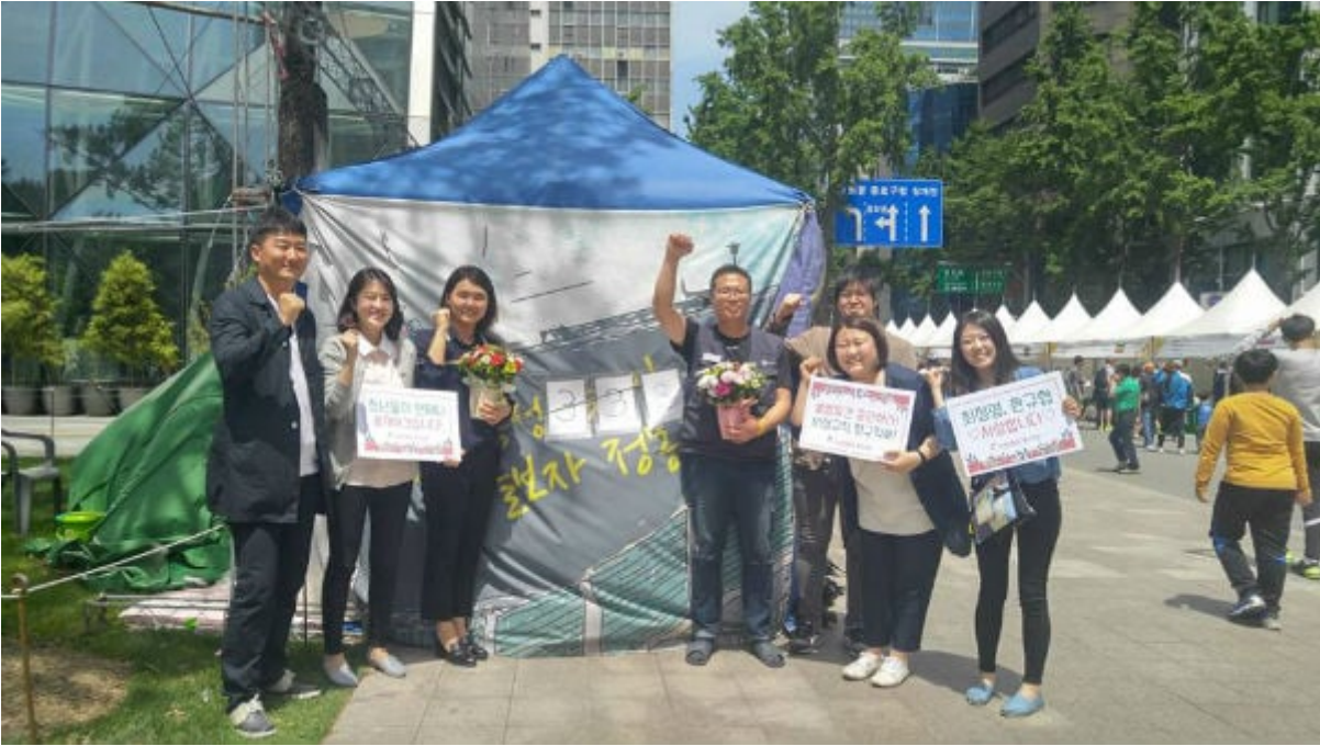
Supporters of the roof-top sit-in on the ground.