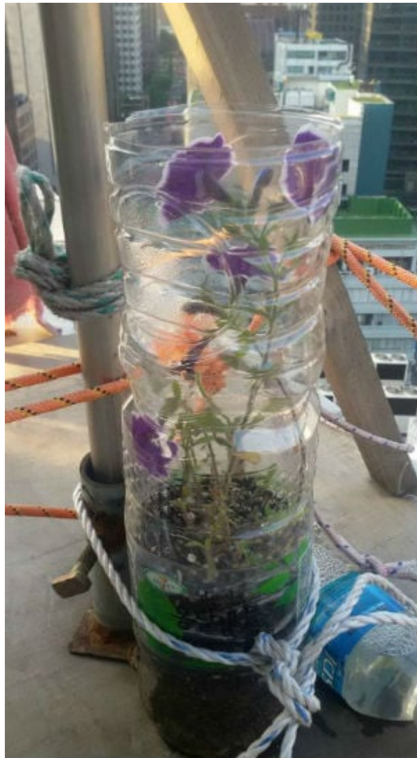
Plants being grown on the roof by the two sit-in protesters.