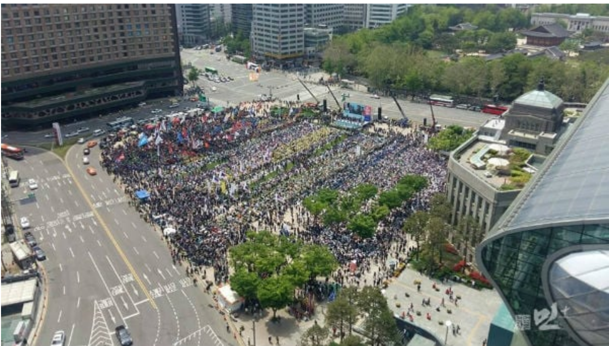
Photograph taken from the roof-top of the supports of the KIA Motors temporary employees gathering on the ground on World Labour Day.