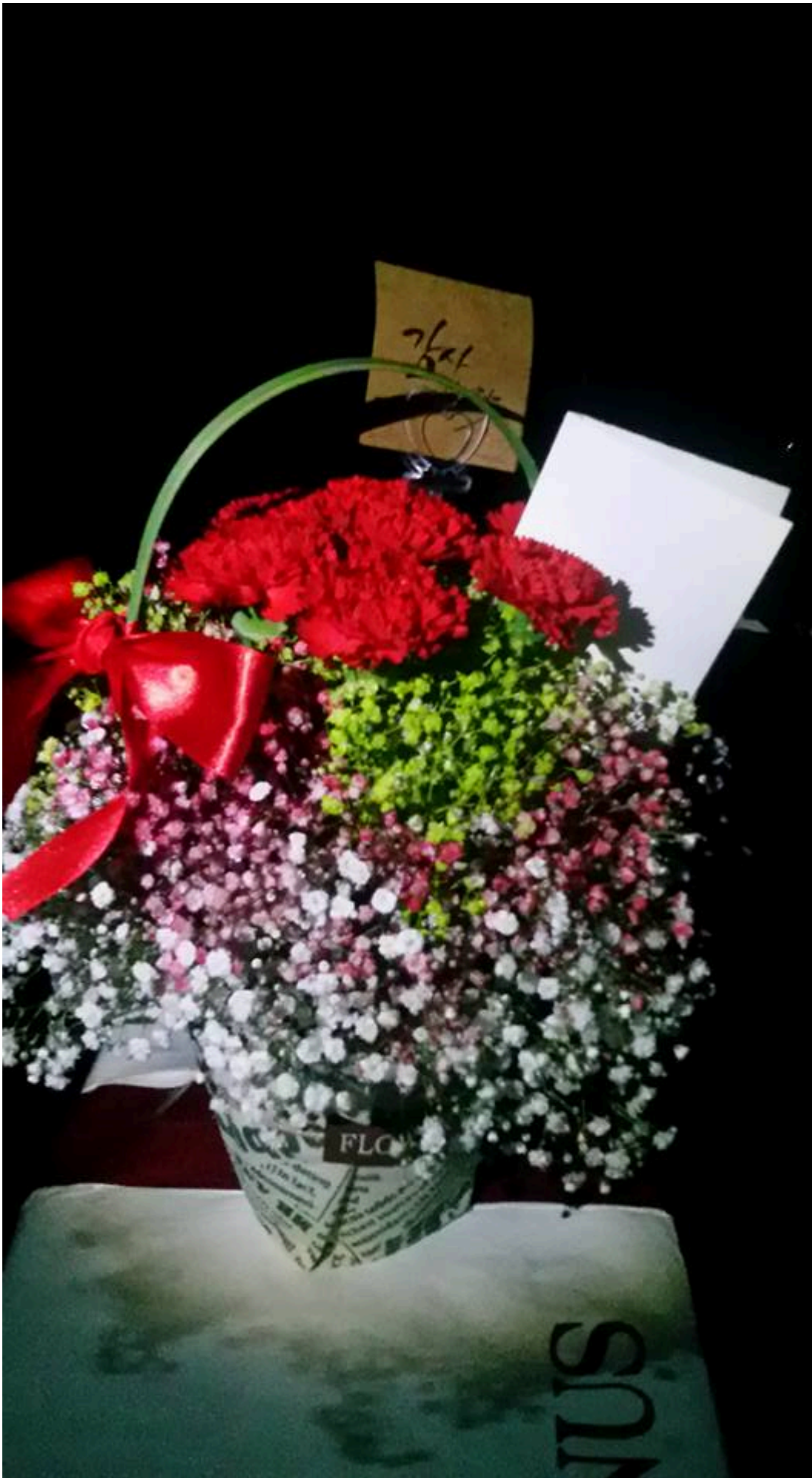
Flowers sent by one of the sons of the two KIA Motors temporary employees.