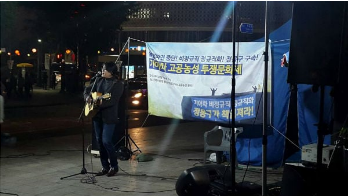
Musician supporters on the ground playing music in solidarity with the roof-top sit-in.