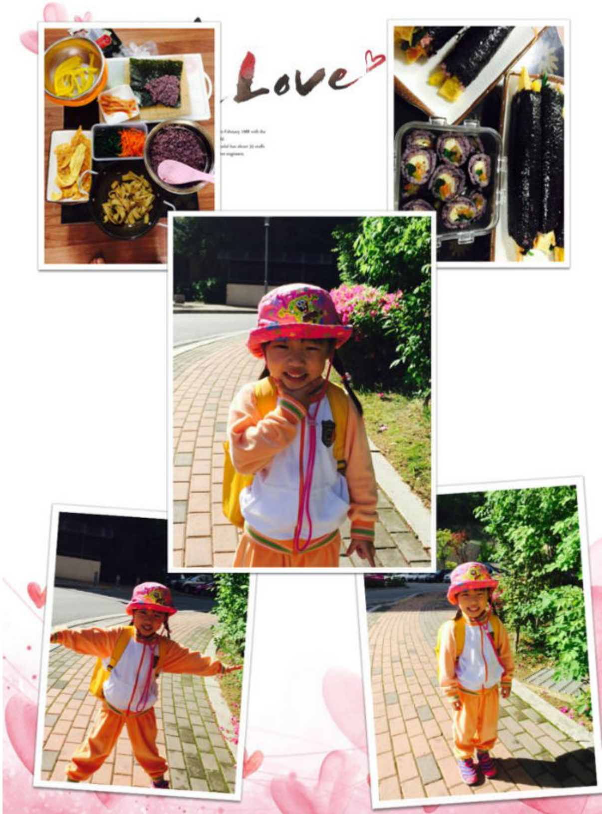
Pictures of meals prepared and setup to the sit-in for Children's Day.