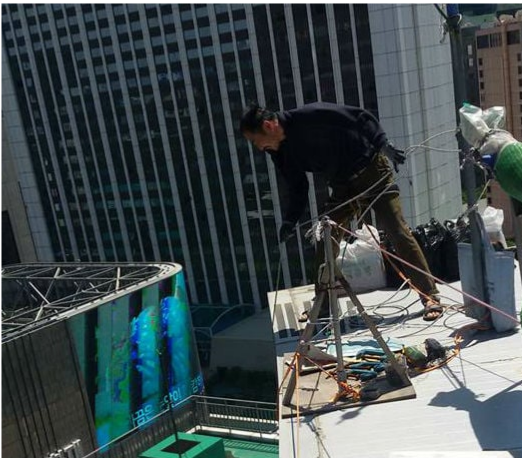
Meals being pulled up by the protesting KIA Motors temporary employees.

Because of the wind and rain, on some days this can be a dangerous task.