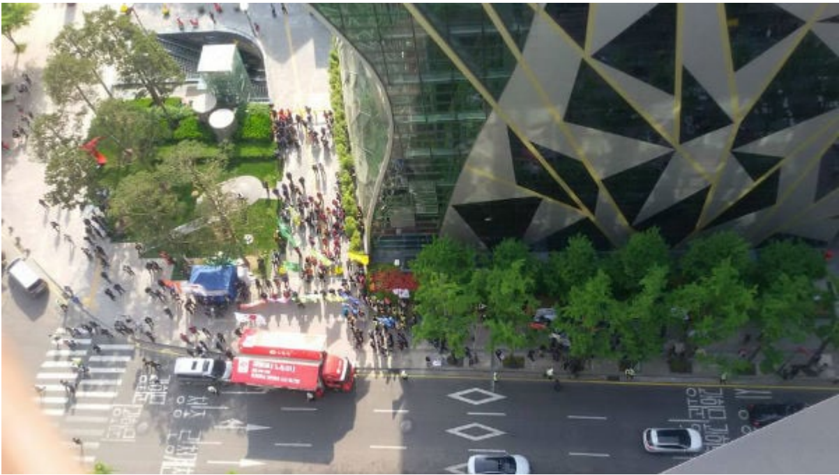
Photograph taken from the roof-top of the supports of the KIA Motors temporary employees gathering on the ground on day 324 of the protest.