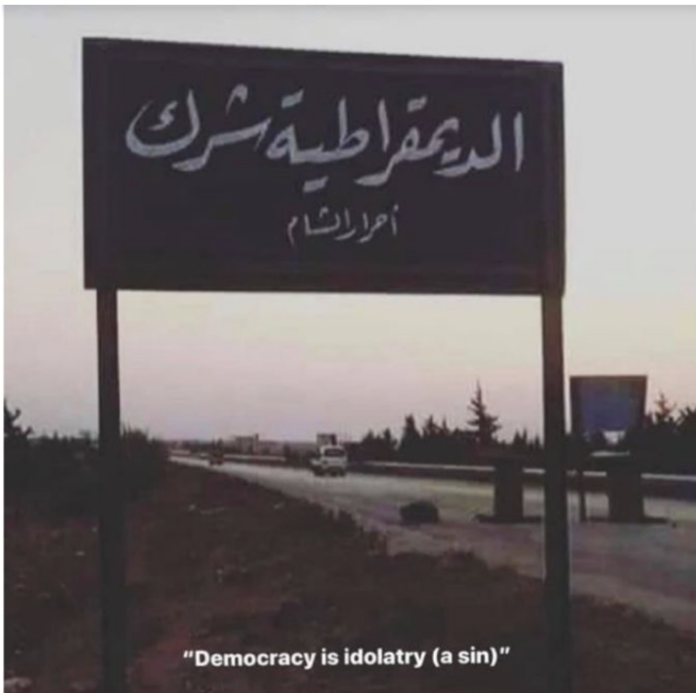
Idlib, Syria, 2020

Western-supported terrorist-controlled areas in Syria have always been anti-democratic. It is not a secret. It is openly proclaimed.