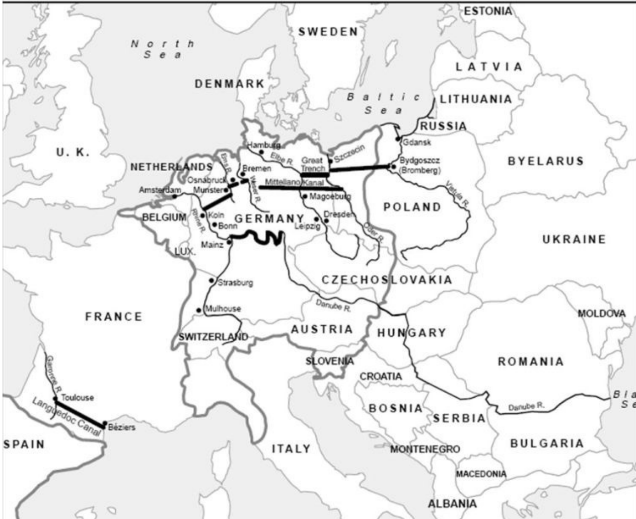
FIGURE 1 Three Centuries' Canal and River Development Initiated by Mazarin and Colbert

One of the first preconditions Mazarin had at the start of the Westphalian treaty's negotiation in 1642 was the ending of tolls on waterways imposed by narrow minded princes and dukes who held territorial controls over sections of river systems throughout Germany which made any economic development of the territory financially unviable. In an early agreement signed in 1642, Mazarin had dozens of princes agree that