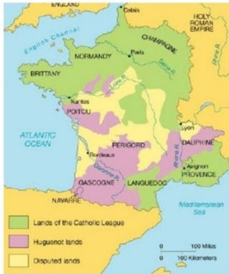
Religious Divisions in France During the Wars of Religion