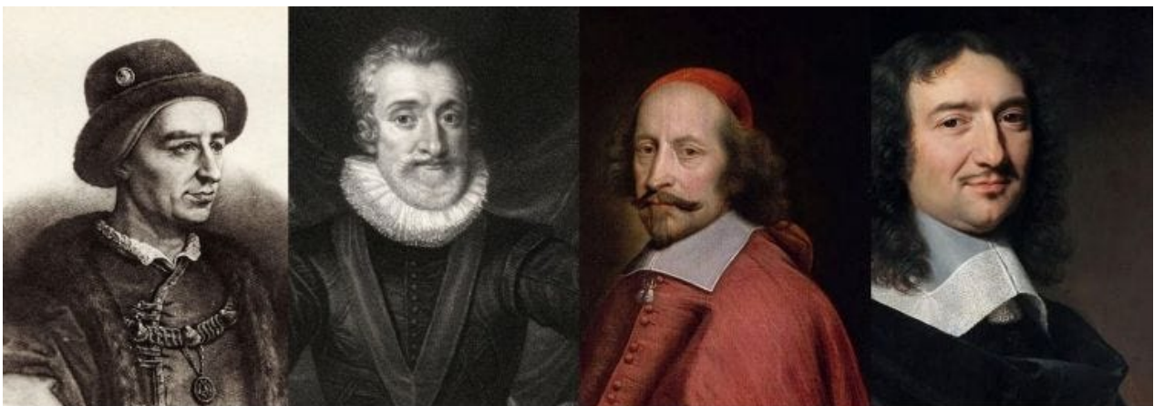
Great French Nation Builders: King Louis XI, Henry of Navarre, Cardinal Mazarin and Finance Minister Colbert

Beginning in 1642, Mazarin began a tedious process of organizing for the Treaty of Westphalia offering to serve as peace broker, lead negotiator and guarantor of religious freedoms for all parties, finally arranging the signing to occur in two locations on October 24, 1648, where protestant signators met in Osnabrück and Catholic signators met in Münster.