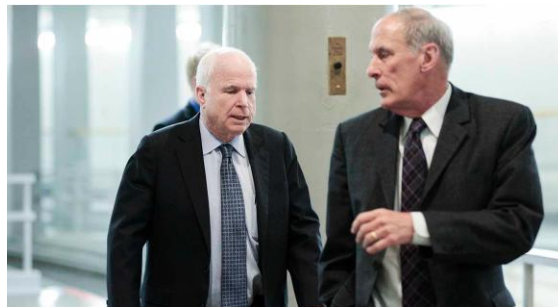
McCain and Coats ( Photo )

The so-called ‘lone wolf’ provision, allowing the targeting of those thought to be terrorists but not associated with a group, and the ‘roving wiretap’ provision, allowing the monitoring of a person irrespective of the devices used by them, also both expired.