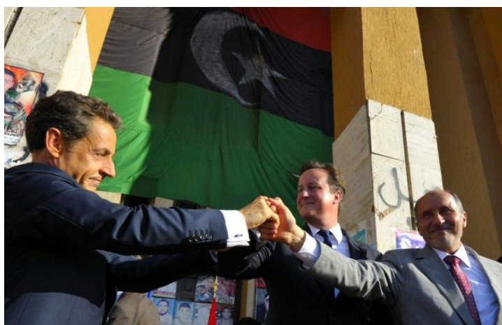
Image: France helped NATO successfully hand Libya over to Al Qaeda terrorists who - with NATO support - would use it as a springboard to attack Syria. The ultimate goal is to use Al Qaeda terrorists to overrun Iran, then southern Russia and western China.