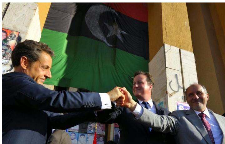
Image: France helped NATO successfully hand Libya over to Al Qaeda terrorists who - with NATO support - would use it as a springboard to attack Syria. The ultimate goal is to use Al Qaeda terrorists to overrun Iran, then southern Russia and western China.