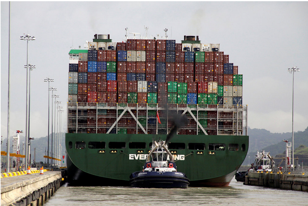
The Neopanamax container vessel EVER LOADING transits the Expanded Canal on the outskirts of Panama City, Panama, June 26, 2017.

It should be pointed out that China and Panama established diplomatic relations just two years ago and that relations between the two countries have greatly expanded in the intervening period, so the Central American state is already on excellent terms with China.