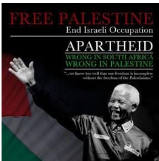
Image on the right: South African President Nelson Mandela in solidarity with Palestine

South African President Cyril Ramaphosa described the move by Mahamat as “appalling” particularly in light of the recent Israeli Defense Forces (IDF) bombardments of the besieged Gaza Strip and the continuing attacks by the police and IDF on Palestinian civilians in the other occupied territories.