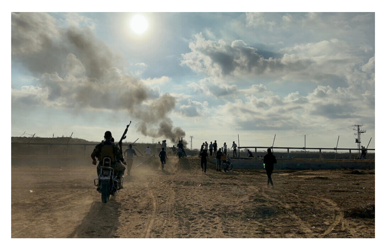
PALESTINIANS CROSSING THE BORDER FENCE INTO ISRAEL FROM KHAN YUNIS IN THE SOUTHERN GAZA STRIP ON OCTOBER 7, 2023.