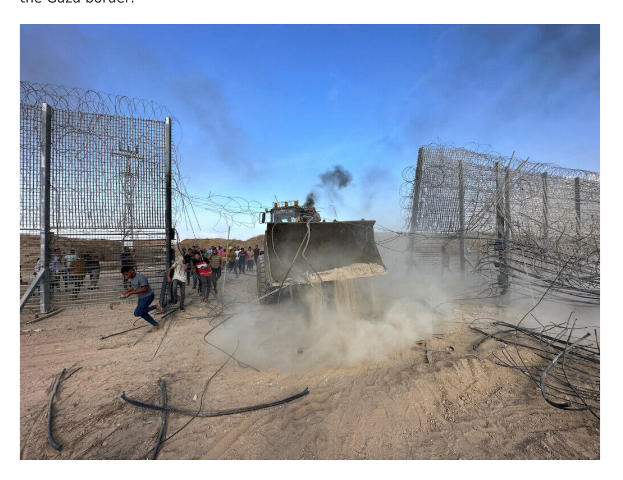
PALESTINIANS BREAKING DOWN THE BORDER FENCE WITH ISRAEL FROM KHAN YUNIS IN THE SOUTHERN GAZA STRIP ON OCTOBER 7, 2023.