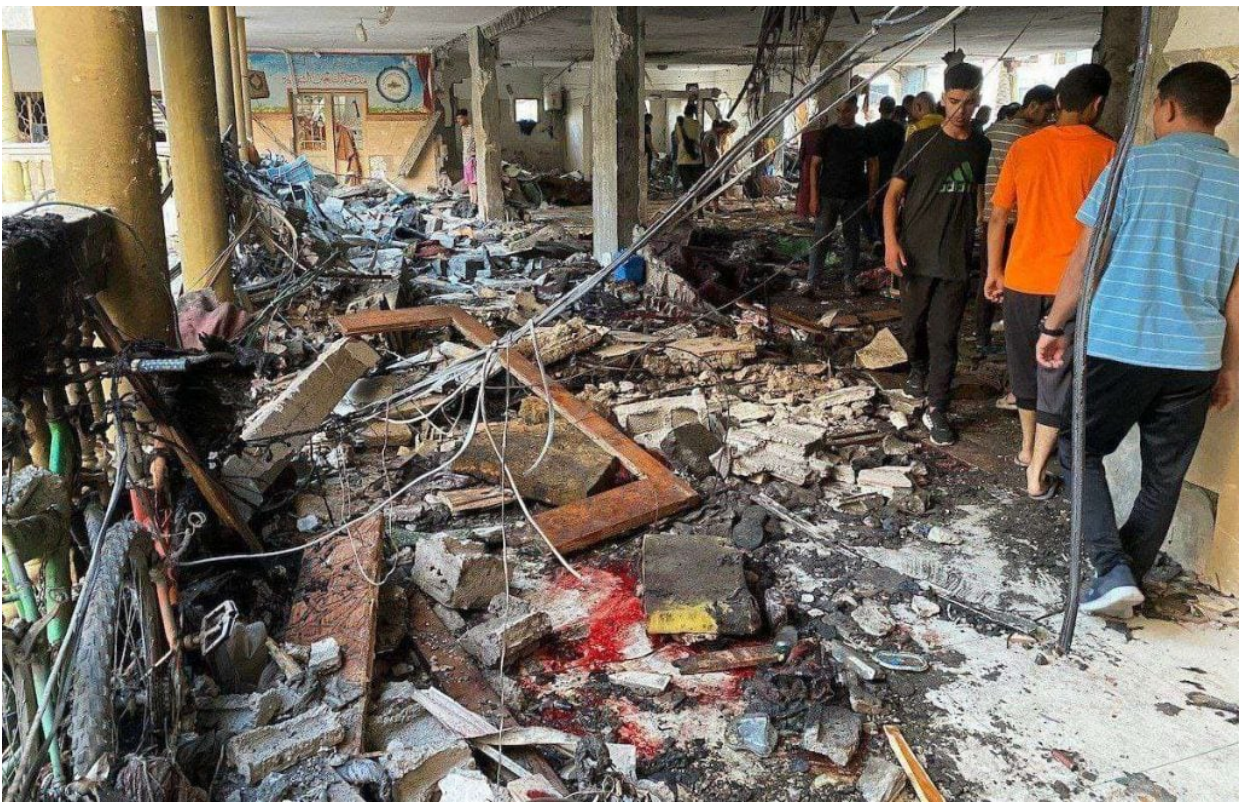
The bombing of Al Tabeen school in Gaza

if the world were watching the livestreamed systematic annihilation of Jews in real time, there would be no debating whether that constituted terrorism or genocide.