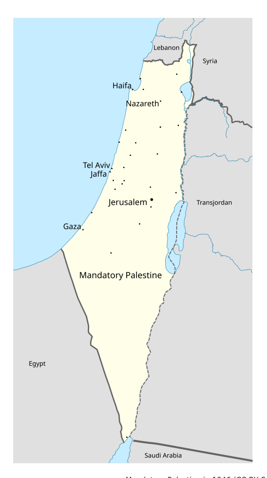
Mandatory Palestine in 1946 (CC BY-SA 4.0)

This fastidious date and controversial decision in 1948 brought about misery for generations of people – Palestinians – on their own land, inflicted by a tiny country implanted on Palestine – but supported by a super-power to the point that this tiny country, called Israel, has itslef become a super-power – on the verge of expanding herself not only over Palestinian terrirtory, but over the entire Middle-East.