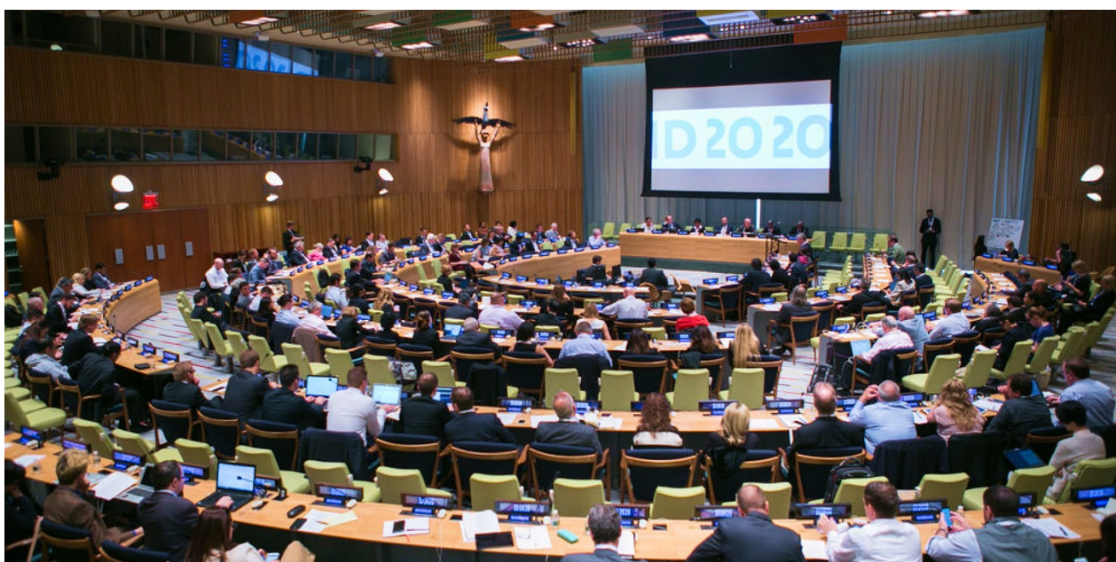
The Trusteeship Council during the ID2020 Summit in 2018

However, the Climate Governance Commission, in its report Governing the Planetary Emergency , has suggested that: "key, powerful actors take adequate responsibility and act in service of the shared interests of all of humanity, life on Earth, and future generations."