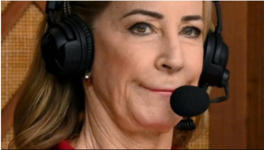
Chris Evert