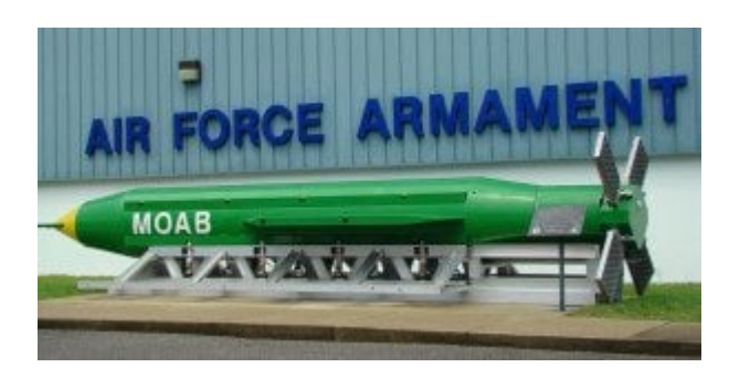
In 2017, Afghanistan saw a mini-surge of roughly 4,000 additional U.S. troops (with more to

As soon as he took office, however, he promptly appointed a set of generals to key positions in his government, stored the mothballs, and went back to war. Here, then, is a brief rundown of the first year of his presidency in war terms.