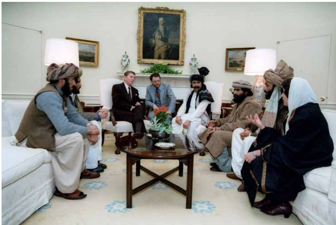
President Ronald Reagan meets leaders of the Mujahideen “Freedom Fighters” at the White House (1980s)

In March 1985, President Reagan signed National Security Decision Directive 166,...[which] authorize[d] stepped-up covert military aid to the mujahideen, and it made clear that the secret Afghan war had a new goal: to defeat Soviet troops in Afghanistan through covert action and encourage a Soviet withdrawal. The new covert U.S. assistance began with a dramatic increase in arms supplies — a steady rise to 65,000 tons annually by 1987, ... as well as a “ceaseless stream” of CIA and Pentagon specialists who traveled to the secret headquarters of Pakistan’s ISI on the main road near Rawalpindi, Pakistan. There the CIA specialists met with Pakistani intelligence officers to help plan operations for the Afghan rebels.[4]