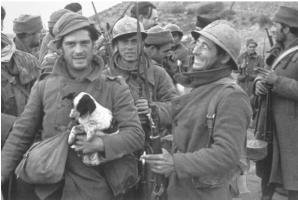
Orwell holding a puppy in Spain during the Spanish Civil War