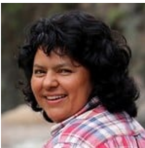
Activist Berta Caceres