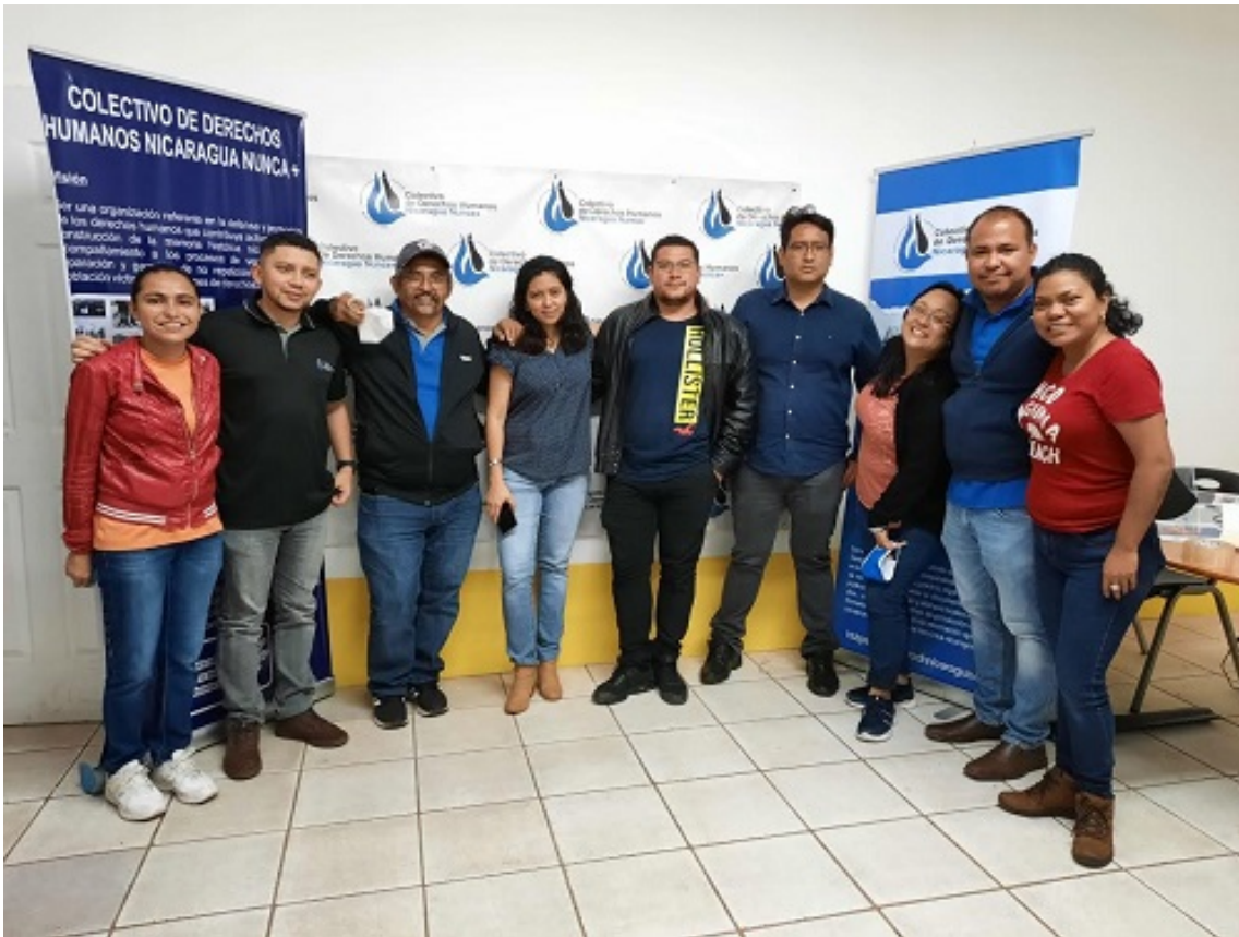
Nicaraguan “human rights” defenders who receive funding from the national Endowment for Democracy.

This money, to the tune of well over a half billion dollars channeled openly, was used for destabilization purposes and for the U.S. failed coup attempt of 2018. Those NGOs participating in the coup were shut down first with good evidence of fraud, treason and money laundering and other crimes that are crimes around the world.