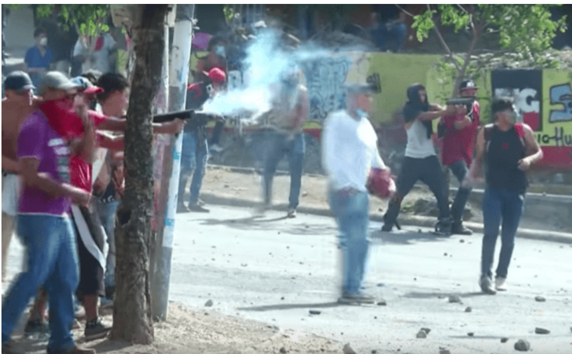
Scene from failed U.S.-backed coup in Nicaragua in 2018.

This money, to the tune of well over a half billion dollars channeled openly, was used for destabilization purposes and for the U.S. failed coup attempt of 2018. Those NGOs participating in the coup were shut down first with good evidence of fraud, treason and money laundering and other crimes that are crimes around the world.