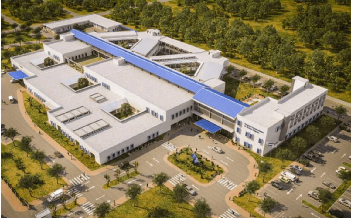
Nicaragua is currently investing U.S.$153 million in 2 new state of the art hospitals (the 23 and 24th they have built since 2008) in Ocotal and in Bilwi, North Caribbean Autonomous Region.