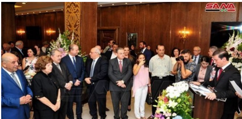
Venezuelan Independence Day is celebrated in Damascus. VP Dr. al Attar, second from left.

Among the dignitaries attending the important event was Dr. Najah al Attar, Syria's vice-president. Contrary to the frothing of the rabid hyenas at the UN — who plot to appoint their choices of women in political positions — Syria has an almost 10,000 year history of women in leadership roles.