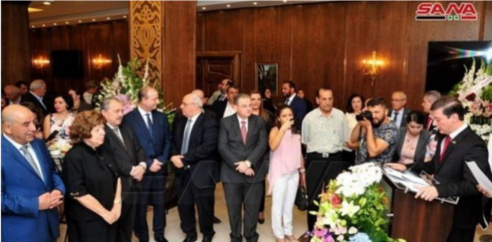
Venezuelan Independence Day is celebrated in Damascus. VP Dr. al Attar, second from left.

Among the dignitaries attending the important event was Dr. Najah al Attar , Syria's vice-president. Contrary to the frothing of the rabid hyenas at the UN — who plot to appoint their choices of women in political positions — Syria has an almost 10,000 year history of women in leadership roles.