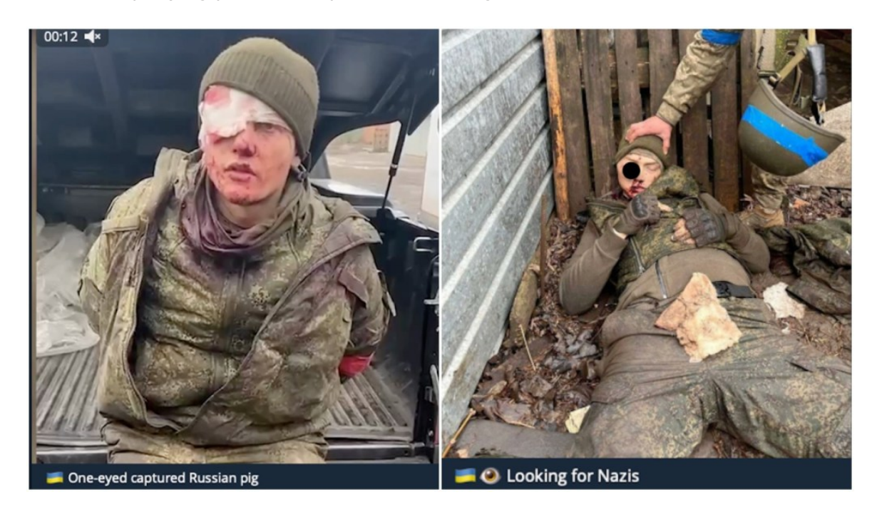
Photos distributed by pro-Ukraine Telegram channels showing captured, tortured and executed Russian soldiers

Perhaps the most gruesome image to have appeared on social media in recent weeks is the photo of a tortured Russian soldier who had one of his eyes gouged before he was killed. The accompanying post was captioned, "looking for Nazis."