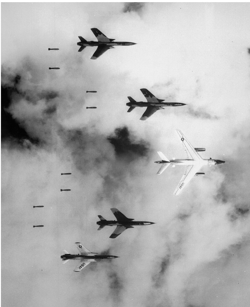
A U.S. B-66 Destroyer and four F-105 Thunderchiefs dropping bombs on North Vietnam during Operation Rolling Thunder

“Listen up,” he said. “We lost 58,000 young soldiers in Vietnam, and they died defending your freedom.”