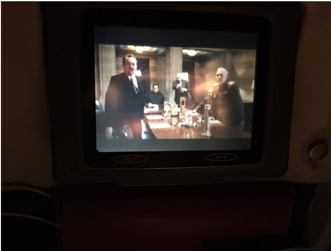
Death of Stalin in one of British Airways' monitors

The Death of Stalin , directed by Armando Iannucci (a BBC and HBO veteran), is simply a bad movie. BA's brief introduction of the film is seasoned with the usual vulgar, lowest grade of contemporary British propaganda, which lately is so common in the mainstream UK media and even inside the British Parliament: "the horrors of Soviet Russia", or the, "horrific insanity of life during the Great Terror".