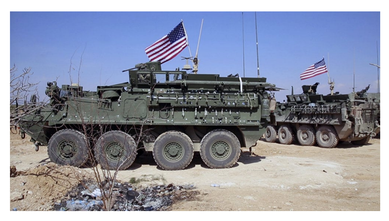
US forces in Manbij area, March 2018

"We are prepared to stay here, as the president (Donald Trump) has made clear ... We are prepared to stay here [in Syria] to ensure the enduring defeat of the Islamic State of Iraq and the Levant [ISIL],"