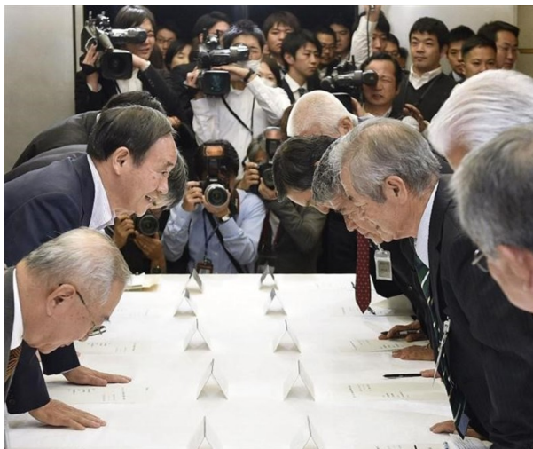
Chief Cabinet Secretary Suga (left) meets heads of the three Kube Districts, Prime Minister’s office.

The ku in rural Japan and Okinawa are the very smallest administrative units, commonly based on traditional and family networks. No head of a ku had ever been invited to the Prime Minister’s residence, seated at the table with top state officials like a head of state, and offered direct subsidy from state coffers.