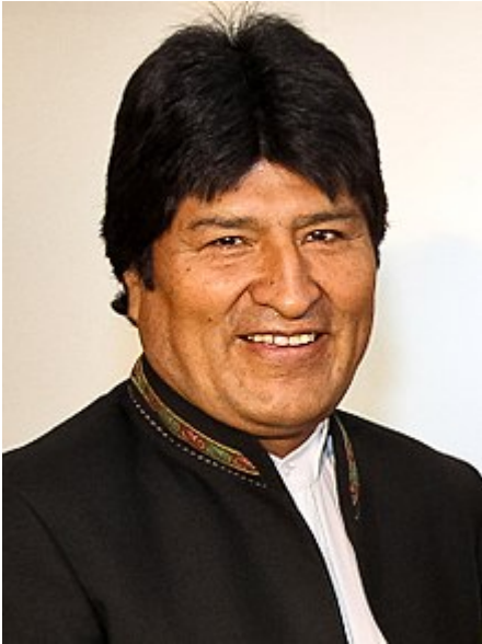
President of Bolivia Evo Morales

Evo Morales visited China after being elected President of Bolivia. The Socialist politician praised Mao's "Proletarian Revolution" during his state visit to China, and since Morales election, China has purchased natural resources from Bolivia at a very high rate. China's investments throughout south and central America have greatly increased in the last two decades. Petrobras, the state owned oil company in Brazil, has greatly benefitted from Chinese investment. China has also assisted Brazil in constructing hydro-power plants and bringing electricity to impoverished rural areas.