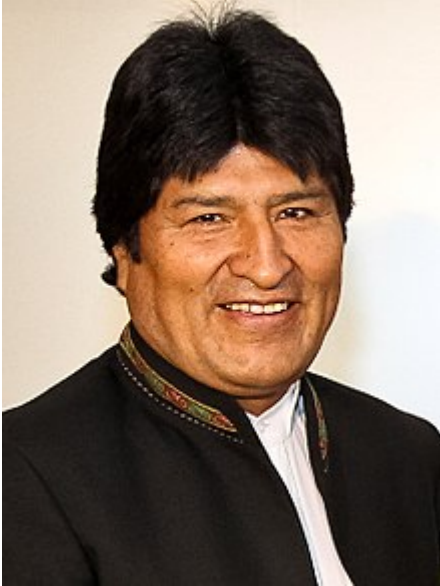
President of Bolivia Evo Morales

Evo Morales visited China after being elected President of Bolivia. The Socialist politician praised Mao's "Proletarian Revolution" during his state visit to China, and since Morales' election, China has purchased natural resources from Bolivia at a very high rate. China's investments throughout South and Central America have greatly increased in the last two decades. Petrobras, the state-owned oil company in Brazil, has greatly benefitted from Chinese investment. China has also assisted Brazil in constructing hydro-power plants and bringing electricity to impoverished rural areas.