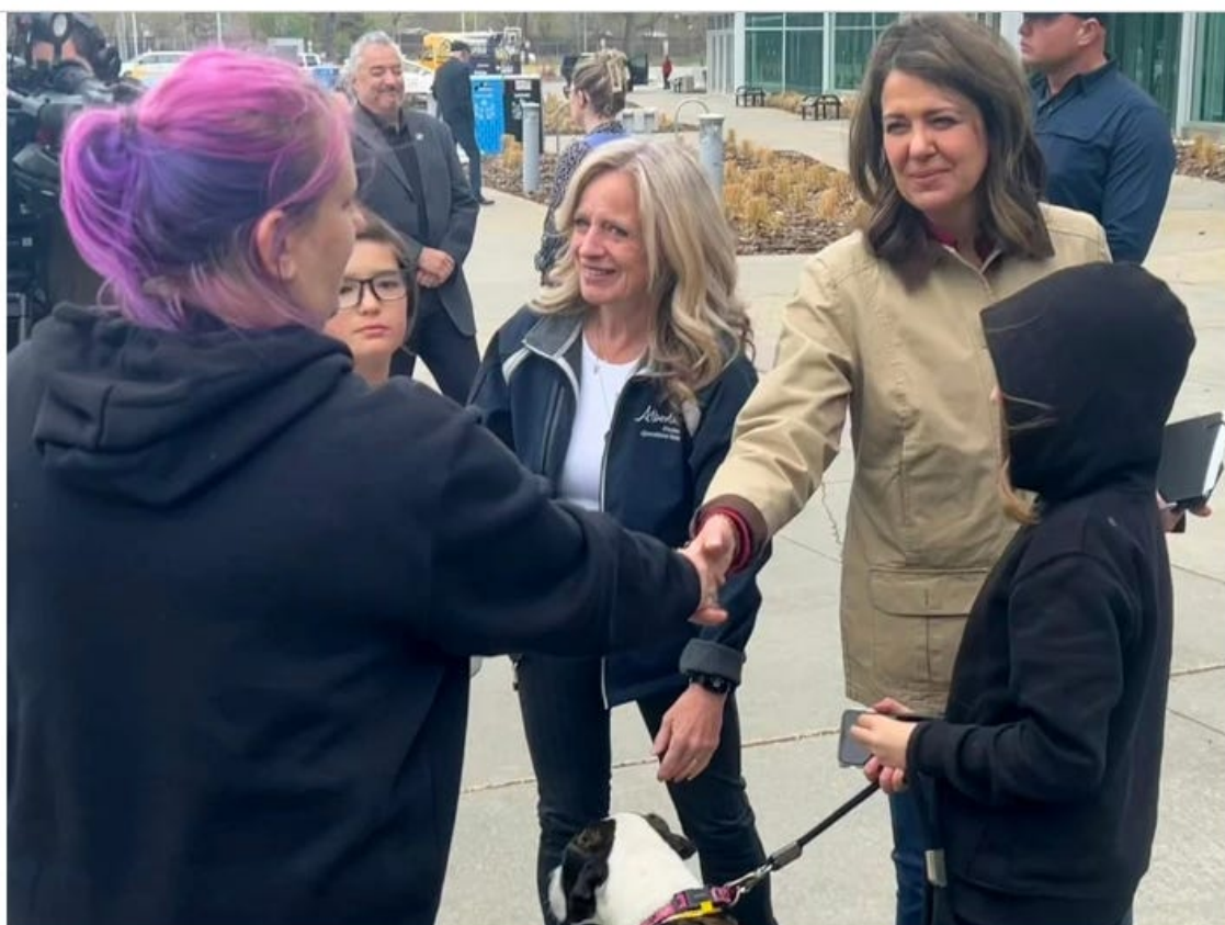
Alberta NDP Leader Rachel Notley, left, and Alberta UCP Leader Danielle Smith meet with evacuees from Alberta wildfires at the Edmonton Expo Centre on Sunday, May 7, 2023.

UCP Leader Danielle Smith and NDP Leader Rachel Notley met briefly on Sunday. Notley told Smith about her experiences and lessons learned as premier during the Fort McMurray wildfire, then the two went to meet with evacuees of the dangerous Edson area wildfire.