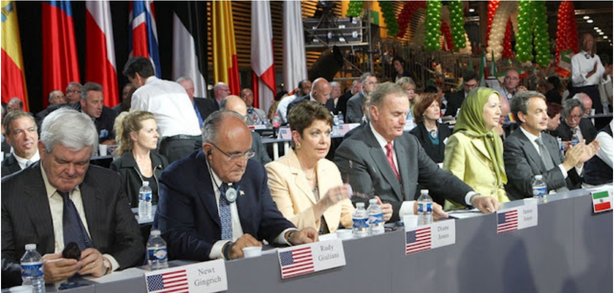
Image: Shoulder-to-shoulder, literally, with Saudi state sponsors of terrorism, America’s “right” attend a rally in support of armed terrorist front, Mujahedeen-e-Khalq (MEK) which kidnapped and killed US military officers, US civilian contractors, and hundreds of Iranian civilians. Many of these characters are regularly interviewed and their views promoted by Breitbart.