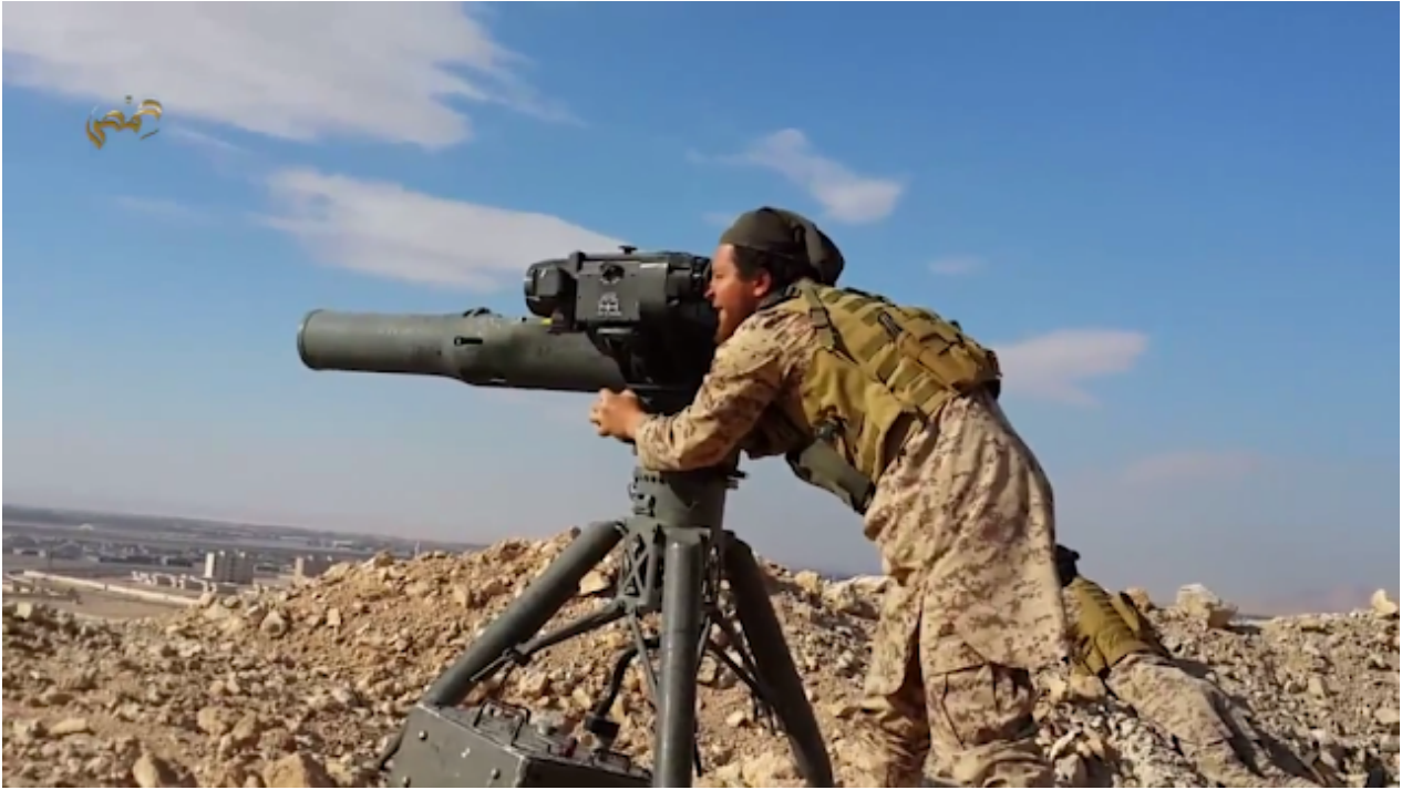
Image: ISIS terrorist wielding a US-made TOW anti-tank missile near Palmyra, eastern Syria.

Saudi Arabia and neighboring Qatar’s state sponsorship of not only armed terrorist organizations, but also indoctrination centers established around the world is the other variable unmentioned by the likes of Breitbart in the “radicalization” equation.