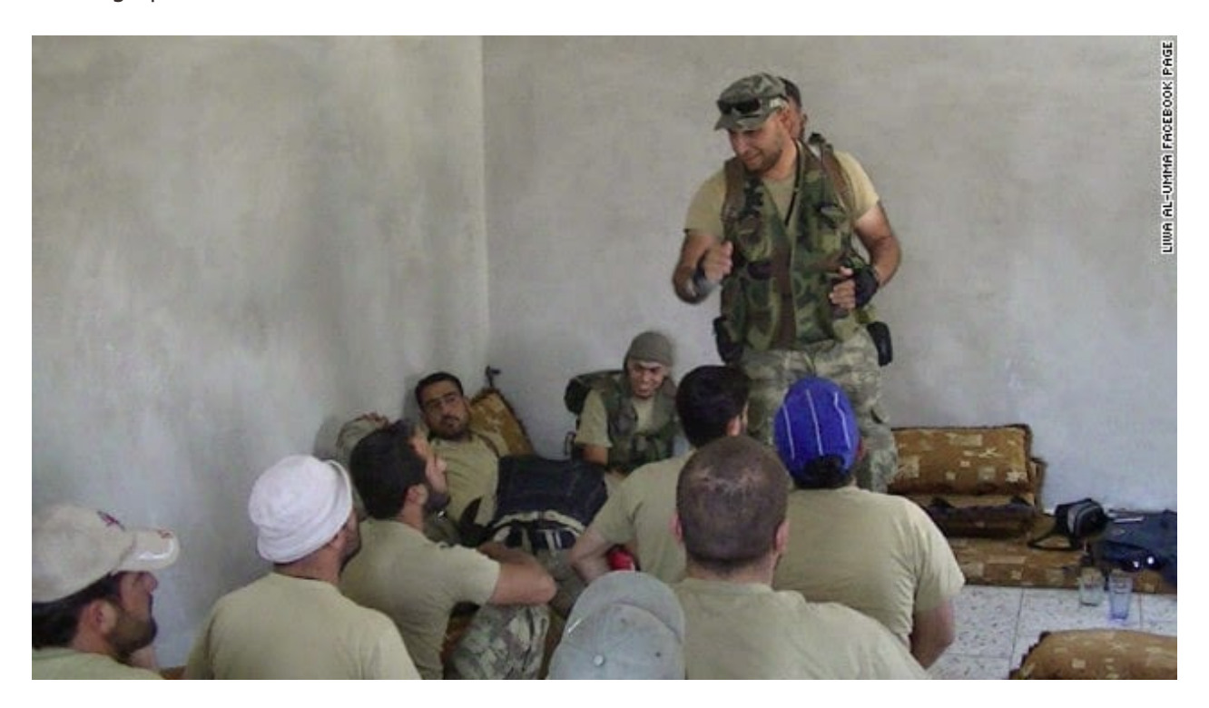
Libyan Terrorists in Syria

Although the documents do not reveal who was responsible for sending weapons to Syria, it is quite obvious from the language used in the documents that it was a US initiative and the CIA presence in Benghazi at the time suggests that US intelligence was behind this gunrunning operation.