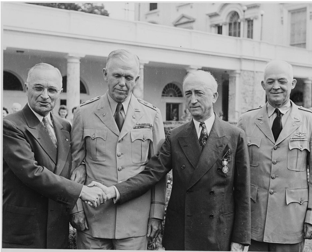
Photograph of President Truman shaking hands with Secretary of State James F. Byrnes after awarding him the Distinguished Service Medal, as General George C. Marshall and General Henry "Hap" Arnold look on.

But the United States, the only power already guilty of nuclear manslaughter, continues to perfect its nuclear arsenal and to proclaim its "right" to launch a "first strike" whenever it chooses.