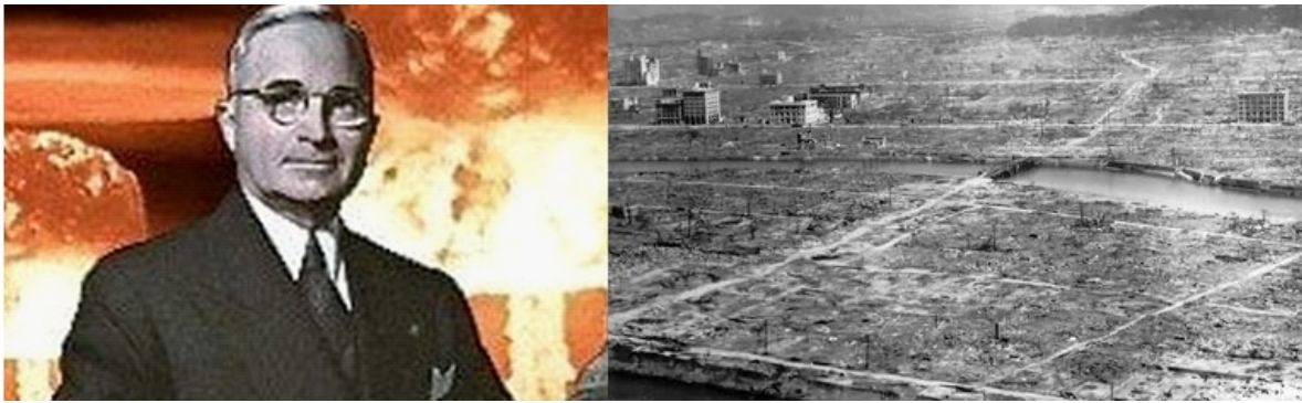
Fig. 2. “Atomic butcher” Truman and his fruit

Truman continued the legacy of Hitler’s gas ovens in the “death camps” such as Auschwitz with sophistication and brilliance. This was done as means of furthering the racist ideology outlined in “Mein Kampf”, which will mark its 100th anniversary in 2025. This innovative Western policy has been globalizing genocidal HaN practices for 79 years, ultimately in the official policy of the “ NATO nuclear alliance ” which includes 32 European countries [12].