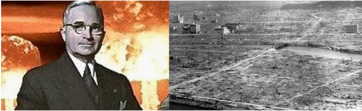
Fig. 2. “Atomic butcher” Truman and his fruit

Truman continued the legacy of Hitler’s gas ovens in the “death camps” such as Auschwitz with sophistication and brilliance. This was done as means of furthering the racist ideology outlined in “Mein Kampf”, which will mark its 100th anniversary in 2025. This innovative Western policy has been globalizing genocidal HaN practices for 79 years, ultimately in the official policy of the “ NATO nuclear alliance ” which includes 32 European countries [12].