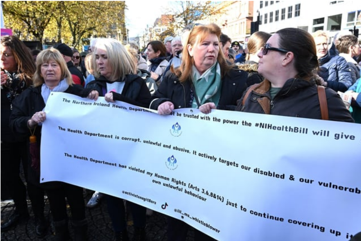
Protestors pictured at Belfast City Hall against the NI Public Health Bill.