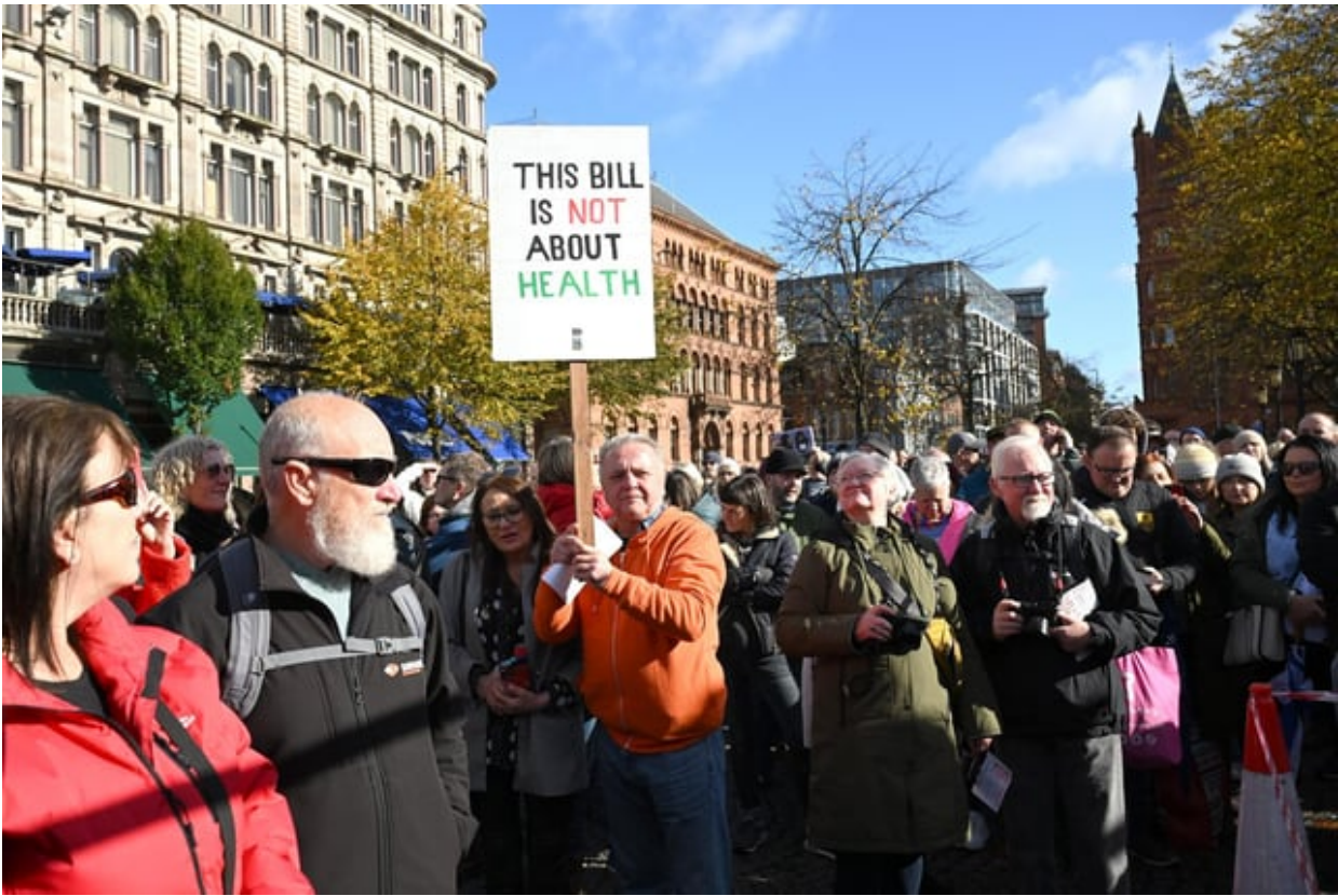
Protestors pictured at Belfast City Hall against the NI Public Health Bill.