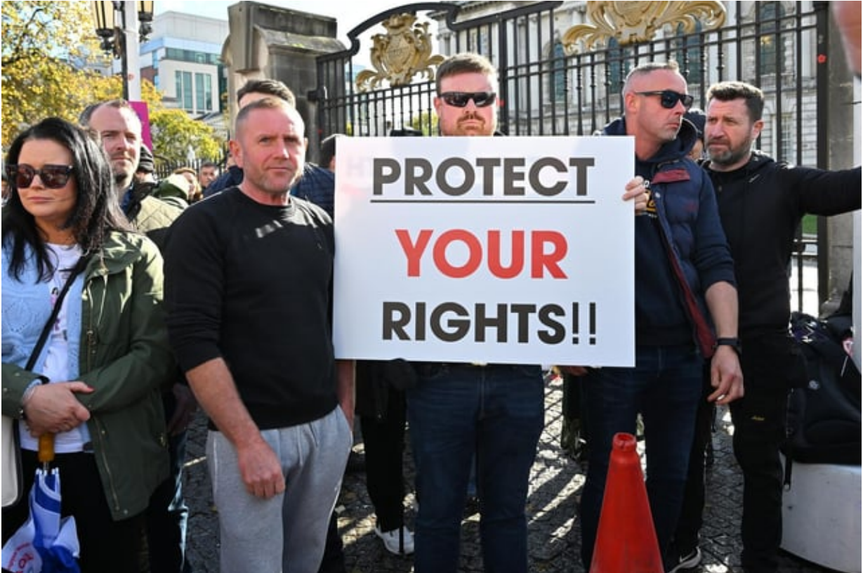
Protestors pictured at Belfast City Hall against the NI Public Health Bill.