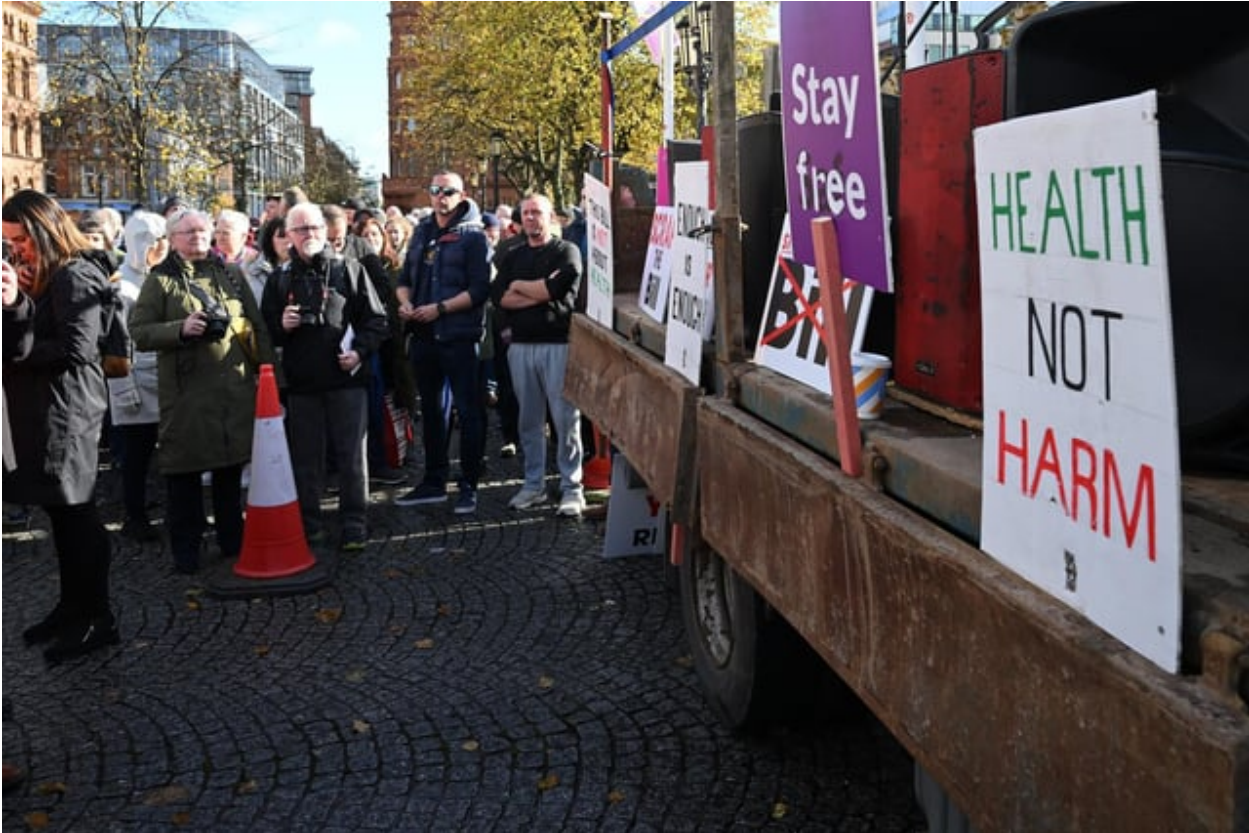
Protestors pictured at Belfast City Hall against the NI Public Health Bill.