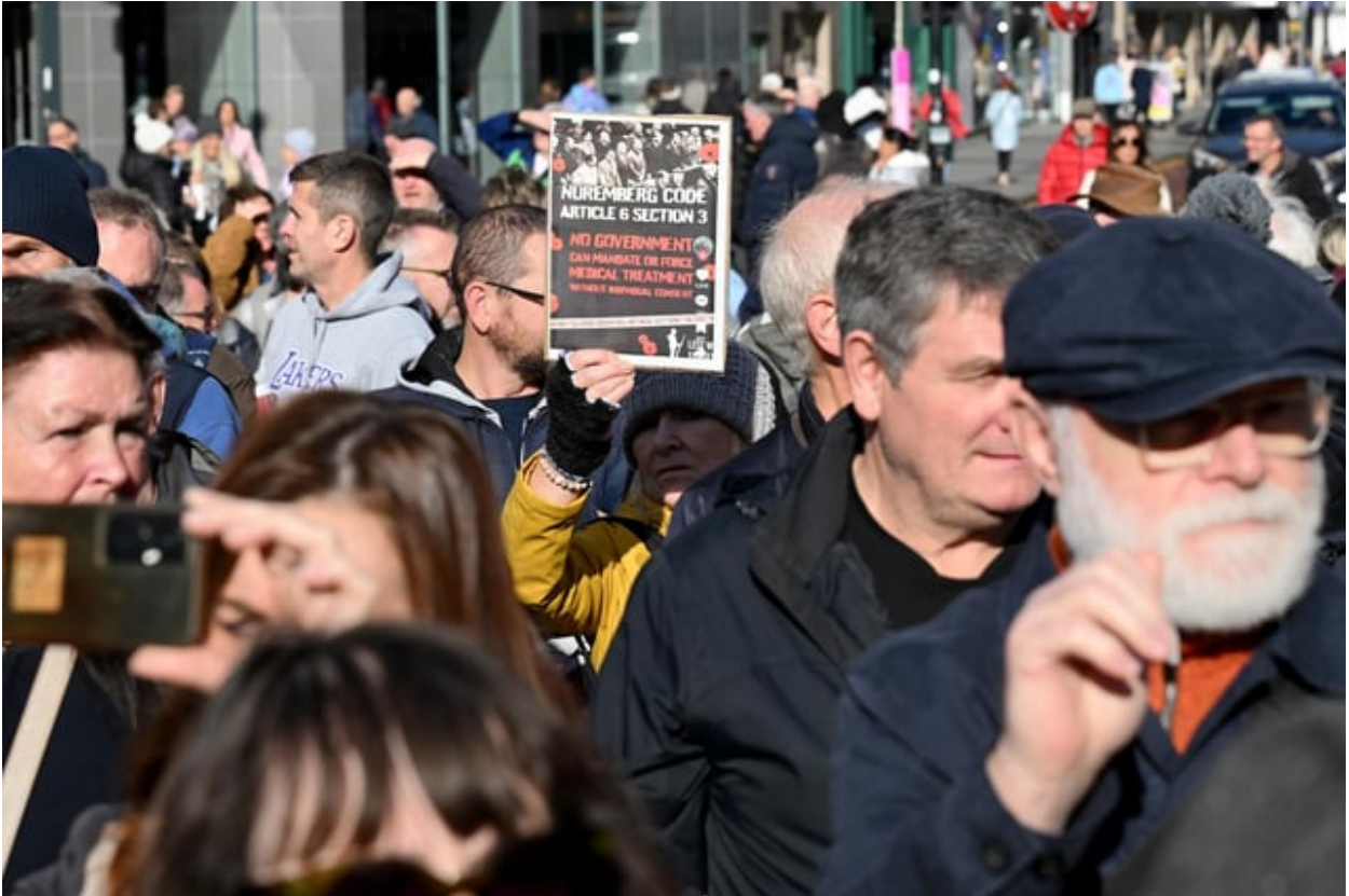
Protestors pictured at Belfast City Hall against the NI Public Health Bill.