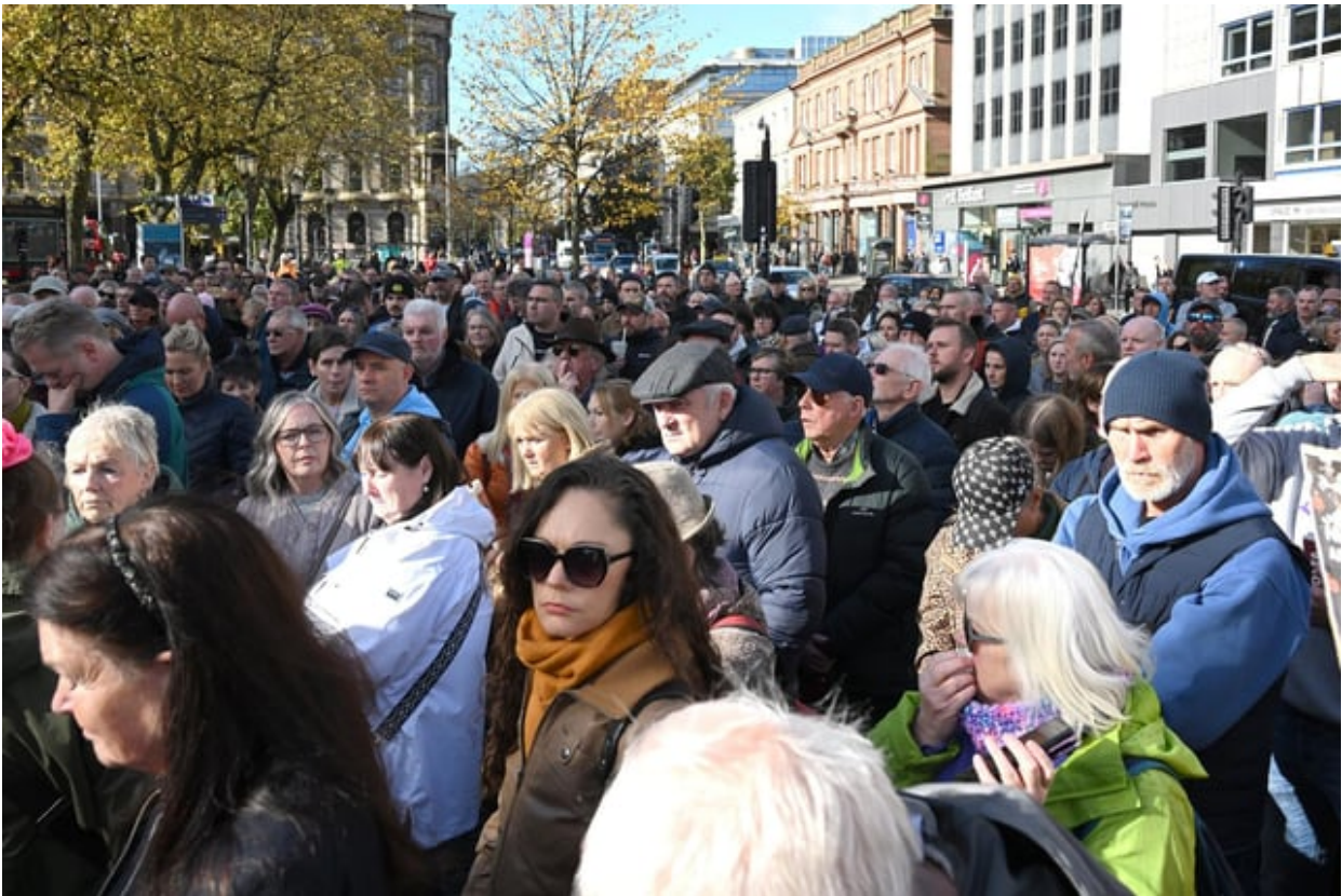
Protestors pictured at Belfast City Hall against the NI Public Health Bill.