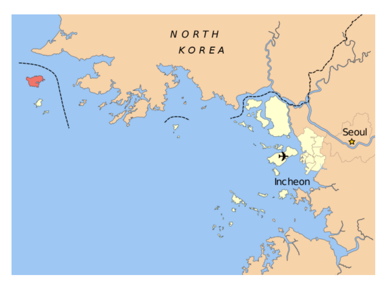
Map of Baengnyeong Island (1)