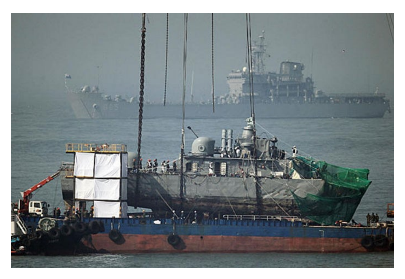
The stern of the Cheonan docked on a barge off Baengnyeong Island on 7 May, 2010.

However, it remains an enigma as to who fired or set off a torpedo or underwater mine. The South Korean right, claiming that a North Korean semi-submersible ship fired a torpedo, demands that the South Korean government launch a revenge attack on the North. The left and pacifists in the South suggest that the warship may have touched off an underwater mine installed in the 1970s by the South Korean military to prevent North Korean infiltration and still left there.