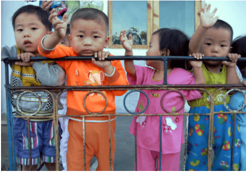
North Korean kids (image left)

Why would North Korea, or any nation for that matter - not have the same right as the US, UK, Russia, China, France, Israel, India, Pakistan, and the NATO member nuclear weapons sharing states of Belgium, Germany, Italy, Netherlands and Turkey - all of which have allegedly acquired B61 tactical nuclear weapons (Made in America) targeted at Russia, Iran and other countries in the Middle East allegedly for "defense purposes"?