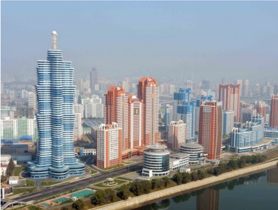
Pyongyang rebuilt today