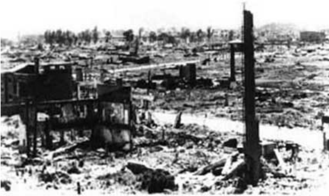
Pyongyang capital of North Korea, in 1953, almost entirely destroyed by U.S. bombing during the Korean War.