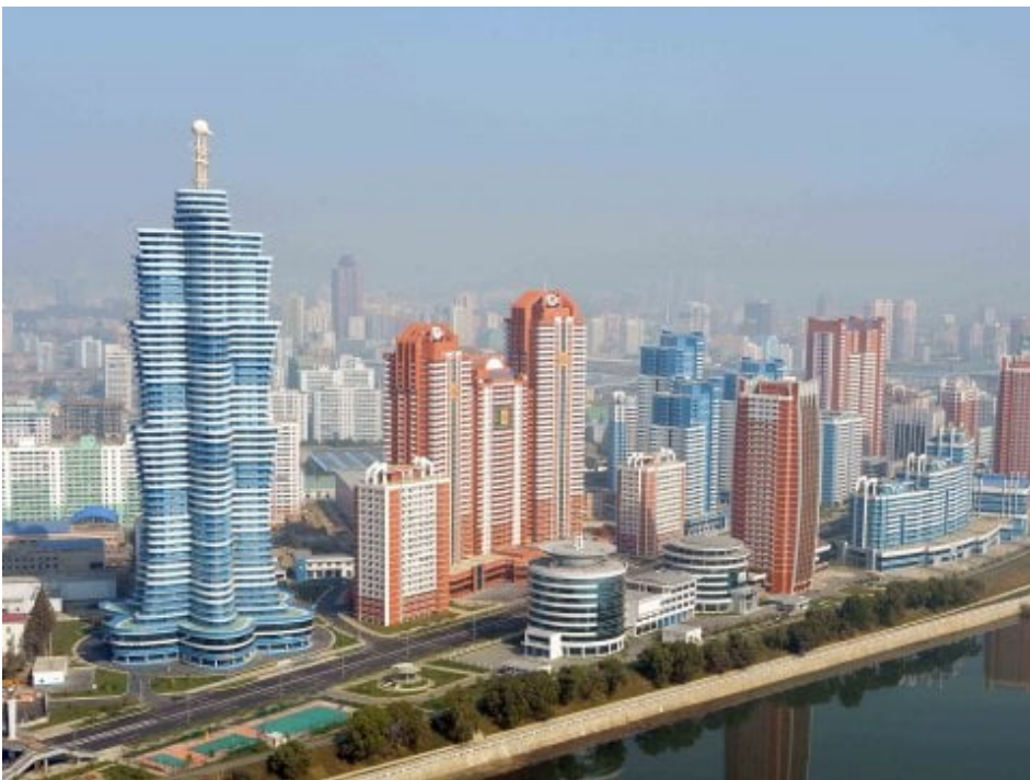
Pyongyang rebuilt today (Trump Doesn't like it, competes with Trump Tower?)

In 1953 when the US had destroyed all and there was nothing left to bomb they turned to bombing the dams, flooding the rice fields and causing starvation. North Korea's government and the country's collective and inherited memory have not forgotten and are simply attempting to insure such a horror never again afflicts their small nation.